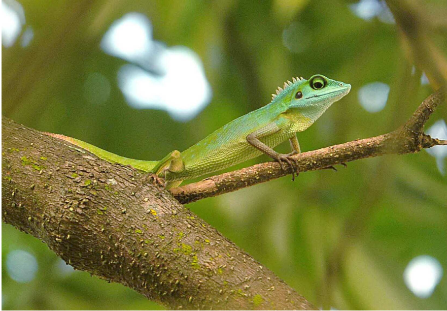
Green Crested Lizard

The walk ended at the junction of the Zhenghua Park with Bukit Panjang Road.