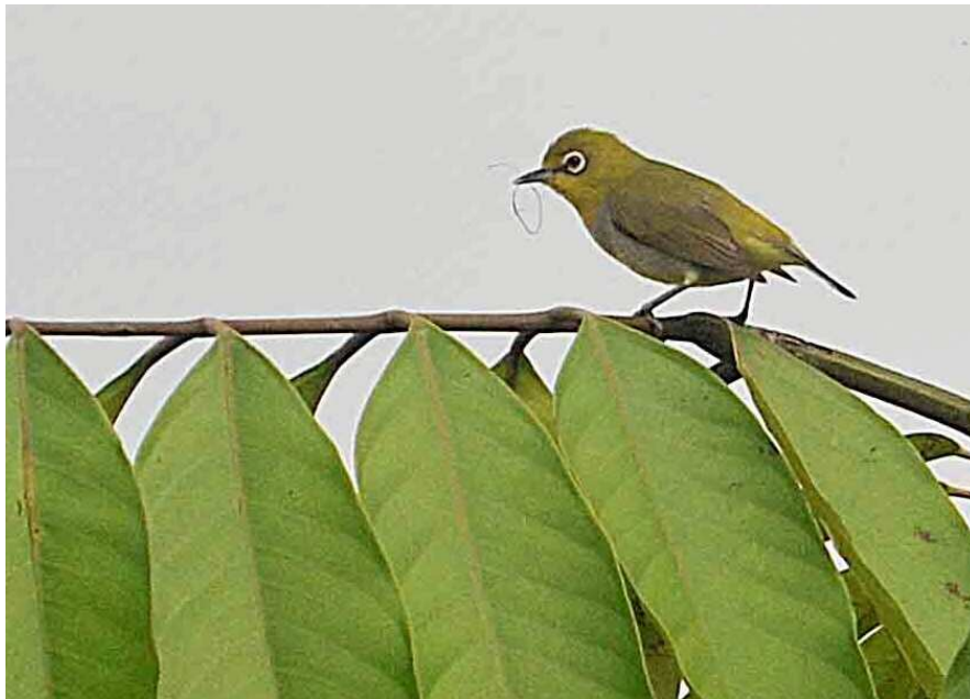
. Oriental White-eye with nesting material

When we turned into the first stretch of the Bukit Panjang Park Connector we were greeted with bird-lives. Many Eurasian Tree Sparrows were chirping and actively moving around. Yellow-vented Bulbuls and Pink-necked Green Pigeons were also present. Oriental White-eyes were active near the junction of Bukit Panjang Park Connector and Zhenghua Park. One was seen picking up some nesting materials. A half-completed nest on a Coral Tree was initially thought to be belonged to Yellow-vented Bulbul. But an Oriental White-eye flew in to show us that she was the rightful owner.