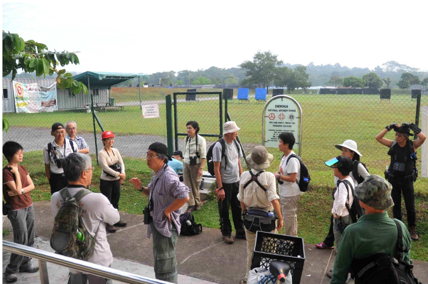
All ready to go at Segar LRT Station

Reported by: Wing Chong, NSS Bird Group.