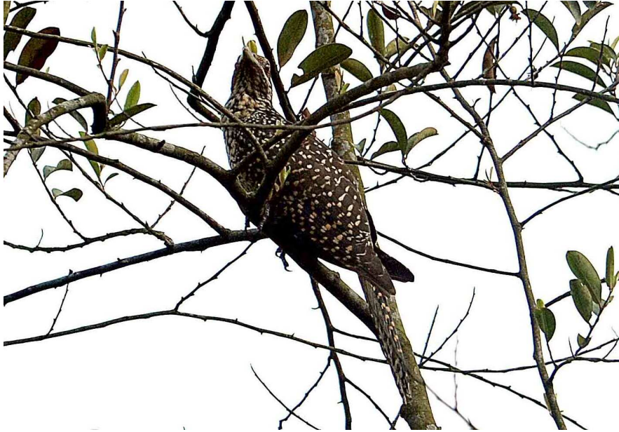
Female Koel that caused a fight

female bird was the real reason for the fight. She stayed, fully exposed on the bare branches despite we were just about 10 meters away. Many photos were taken for this unusually bold, attention seeking female bird.