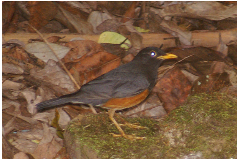
Black-breasted Thrush Turdus dissimilis at the Royal Project.

Formerly considered a winter visitor, this species has been reclassified as a resident.