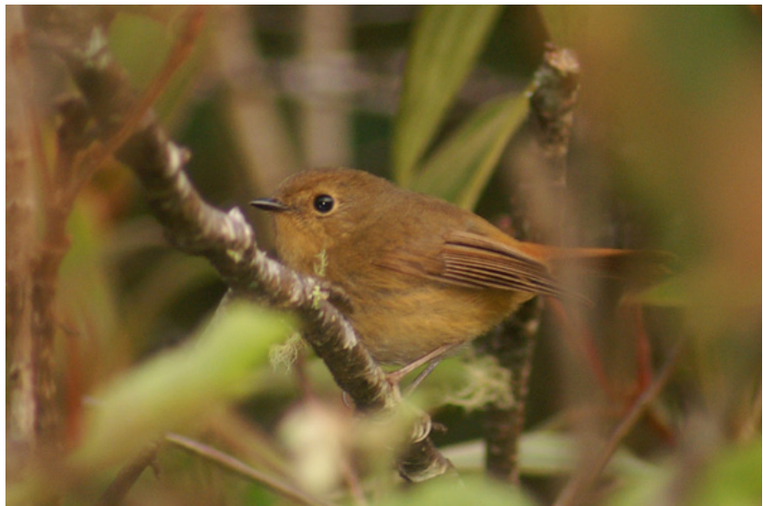
Slaty Blue Flycatcher Ficedula tricolor female

The common Grey-cheeked Fulvetta and Grey-headed Flycatcher were also around. A skulky flycatcher regularly cocked its tail and gave 'tack' calls; it was finally determined to be a female Slaty Blue Flycatcher (lifer), an uncommon bird.