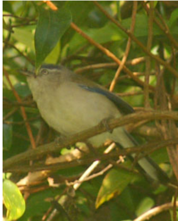
Blue-winged Minla Siva cyanouroptera

We spent an hour at Km 21.3 trail but did not go far. We found 2 Blue-winged Minlas which perched quietly for some preening. A babbler skulked in the undergrowth and it finally showed sufficiently to be identified as a Spot-throated Babbler (lifer).