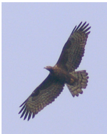
Oriental Honey Buzzard Pernis ptilorhynchus dark morph

We decided to try our luck with the Redstart again. Along the way, we noticed bird activity and stopped the car. First, we had the common Sooty-headed Bulbul, then a Verditer Flycatcher. A Grey-backed Shrike also appeared by the roadside. An incessant call started to fill the air and after some searching, a White-browed Scimitar-Babbler was located below us, on the slope. A Maroon Oriole showed up nearby and the nicest bird was a Chestnut-vented Nuthatch (lifer).