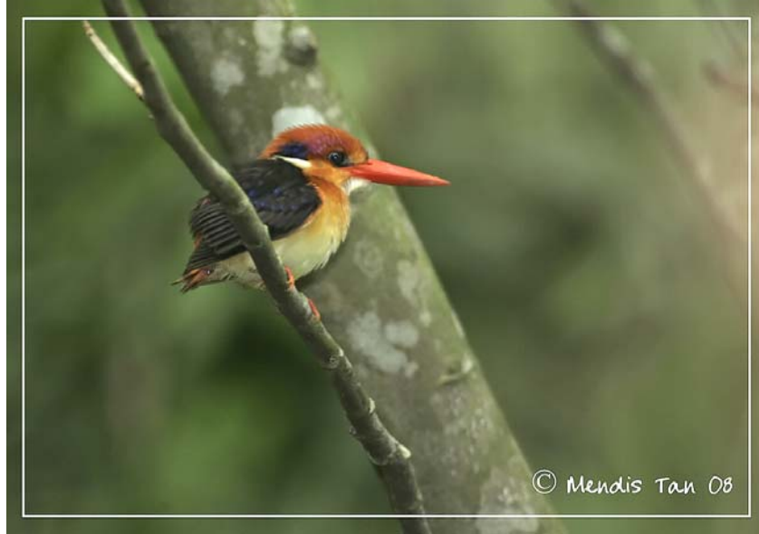
Black-backed Kingfisher at Sungei Buloh Wetland Reserve on 22 October 2008.

The month of October began where September left out, with a flurry of rarities and interesting sightings thanks to the diligence of our resident bird photographers as well as local birders who were doing their rounds in preparation for the 25 th Singapore Bird Race.