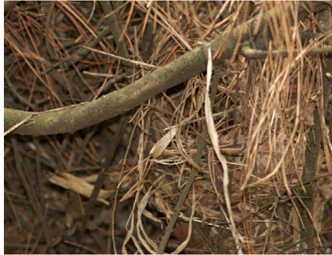
Untidy nest of Rusty-capped Fulvetta

But my efforts were not entirely wasted. While waiting for the pheasant, I found a very noisy Streak-breasted Scimitar-babbler and a pair of Rusty-capped Fulvetta nesting close to the spot where I was hiding. It took me a while to locate the nest as it was very well concealed. The globular shape nest built of dried leaves and small twigs was cleverly concealed in a pile of dried coniferous leaves trapped between a tangle of dead branches. The nest was barely 30 cm above the ground.