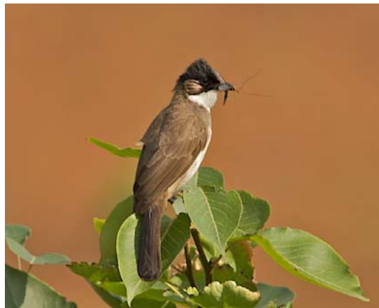
Brown-breasted Bulbul with food