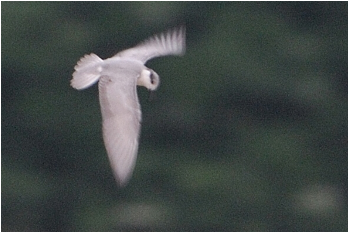
Whiskered Tern at Jurong Lake on 8 October 2008

1 observed 8/10 foraging at Jurong Lake in the evening (MC). It flew towards Japanese Garden at last light.