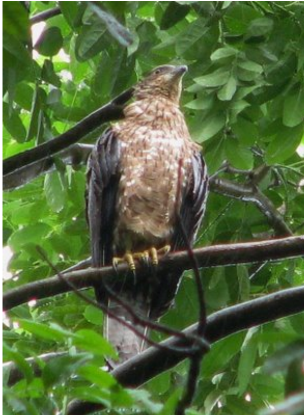
Image A: OHB torquatus race seen in Toa Payoh, Singapore.

On the Monday morning of 10 November 2008, I lingered on at home because of the rain....and it paid off. I happened to look out of the windows while working on my computer, and I saw a raptor fly into the grove of trees in front of my house in Toa Payoh, Singapore, at around 10am. However, the bird got lost in the thick foliage. So I zipped downstairs and after some 15 min of scanning the trees in the constant drizzle, I found the bird huddled high up in the branches above, its back towards me.