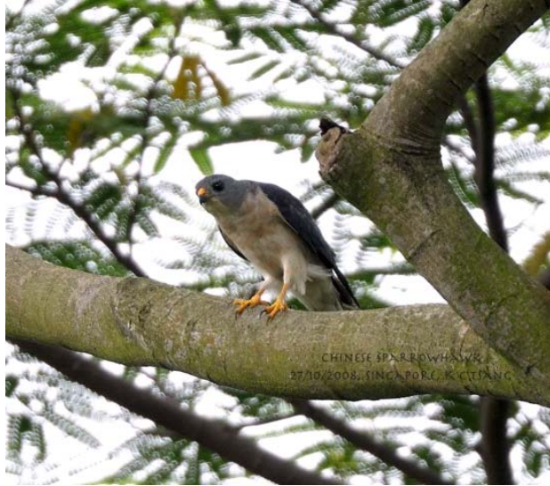
Chinese Sparrowhawk by KC Tsang

27th KC Tsang photographed an adult perched at Kent Ridge Park.