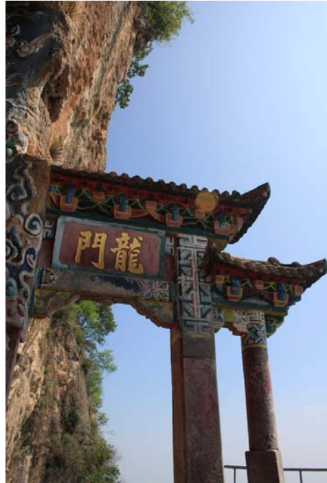
The famous Dragon Gate where tourists flock to.