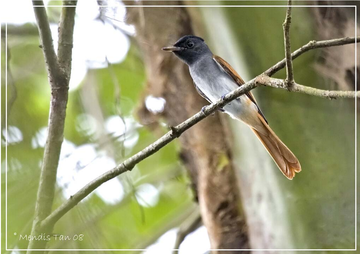
Asian Paradise Flycatcher at SBWR.

2 seen 2/10 at SBWR (MeT). 2 females seen disputing territory at SBWR, 12/10 (DA/LKS). There was tail wagging, slight crest raised and lots of chatter between these two birds on a sea almond tree. 2 were also seen at Sime Road on 26/10 (DA/LKS/WCC).