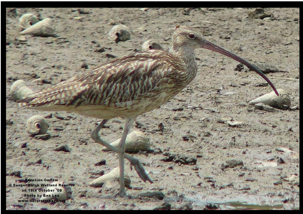
Eurasian Curlew at Sungei Buloh Wetland Reserve on 18 October 2008.

1 seen 18/10 at SBWR (THC/RiT/RT/JL/RH/AN/JT/BL/RK/BC) and again on 19/10 (DT/MeT/SY/ JC).