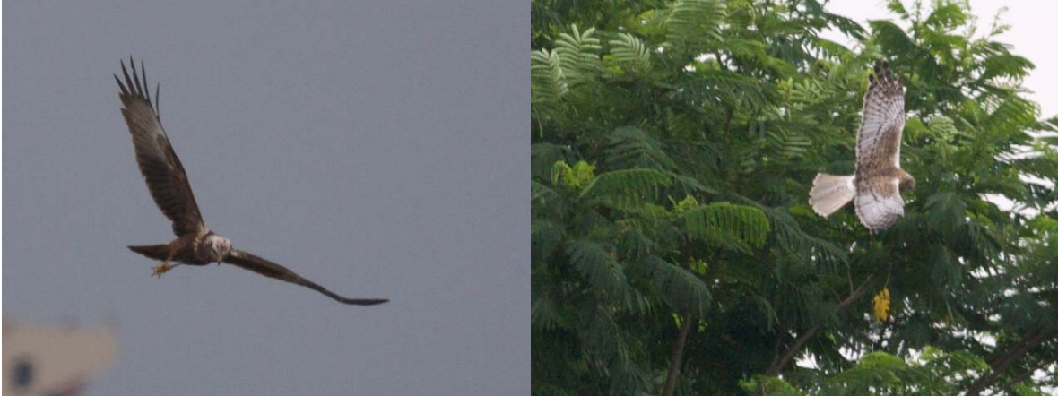
Eastern Marsh Harrier (immature)