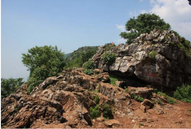
Many boulders at the summit area

My target bird at the summit area was the Godlewski's Bunting. Not knowing what to do and where to find the bird, I simply took a trail that led to the summit. Many boulders dot the plateau in the summit area.