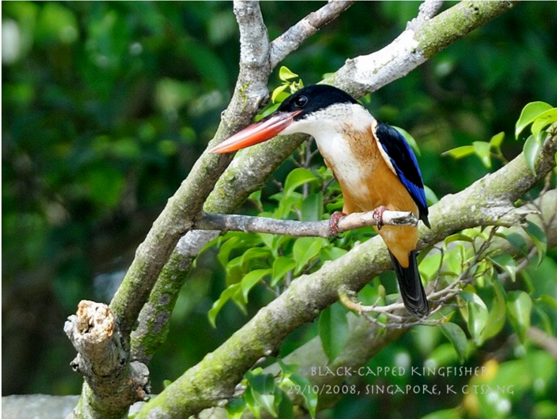
Black-capped Kingfisher at Japanese Gardens.

1 photographed 29/10 and 31/10 at gate area of the Japanese Gardens (TKC)