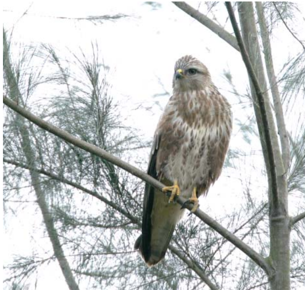
Common Buzzard