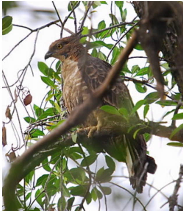
Image D: CHB torquatus race of an adult female in Ipoh, Malaysia.