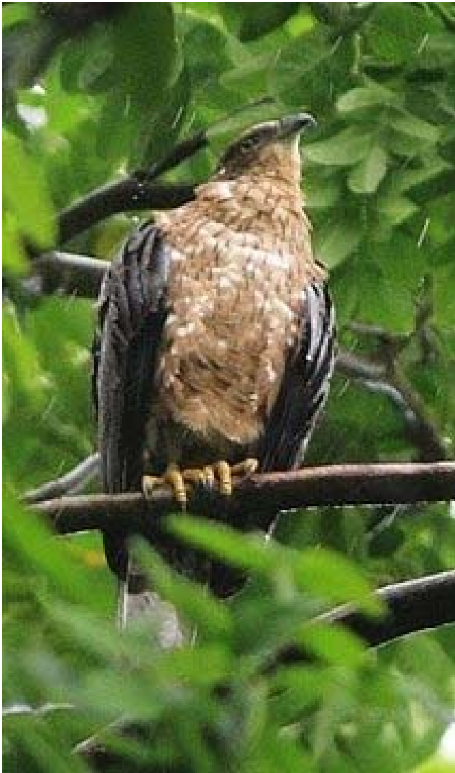
Image B: P.p. torquatus race seen in Toa Payoh, Singapore.

The torquatus race is the resident subspecies of Crested Honey Buzzard (CHB) found in Southeast Asia, with breeding records from the Malay Peninsula, Sumatra and Borneo. In Peninsular Malaysia and Singapore, it is regarded as an uncommon resident with only a few records each year. According to Chiu Sein Chiong, the Toa Payoh torquatus CHB is too young to determine its sex.