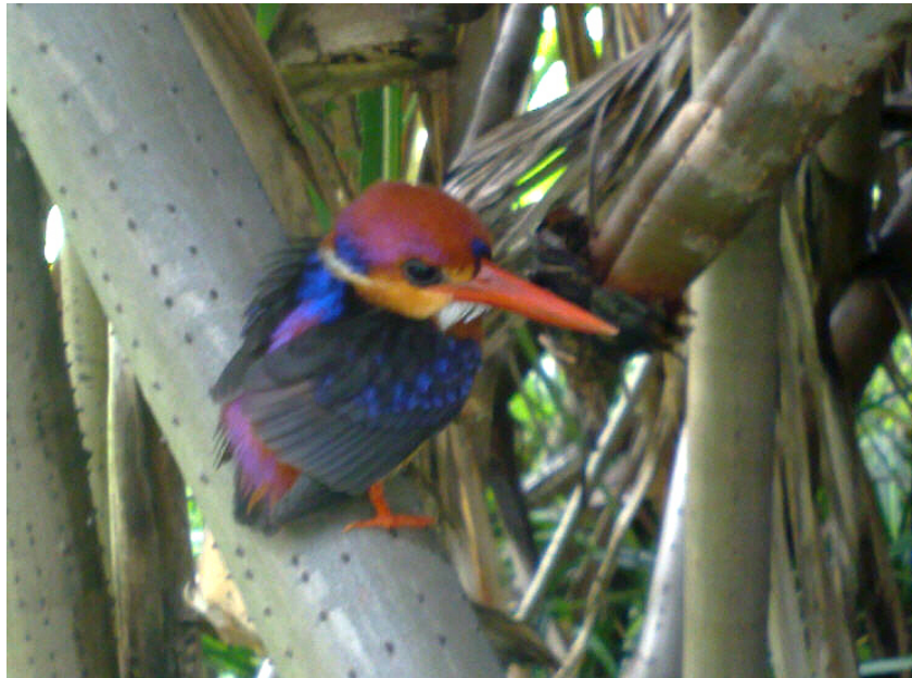
Black-backed Kingfisher at Tuas area.

1 crash-landed 7/10 at a Tuas factory but fortunately survived (KK). 1 photographed 22/10 at SBWR roundabout near the carpark (MeT).