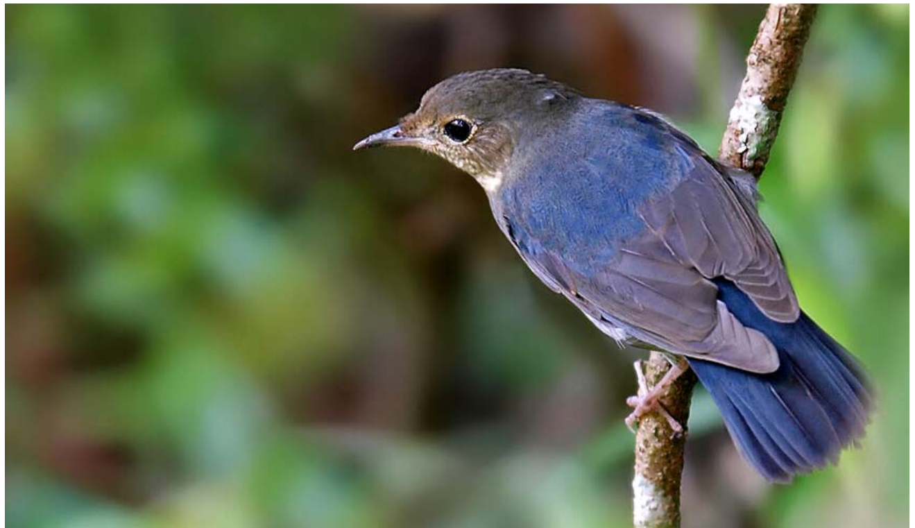
1 st winter male Siberian Blue Robin Luscinia cyane at Nee Soon Swamp Forest on 18 October 2008