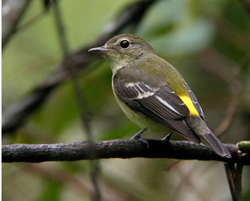
Female Yellow-rumped Flycatcher at Hindhede Park.

1 female photographed 1/10 at Hindhede Park (JS). 1 female photographed 1/10 at SBWR (En). 1 male photographed 2/10 between the Chinese and Japanese Gardens (CYY). 2 females seen 4/10 outside Chinese Garden (PAH). 1 female seen 10/10 (TGC) and 15/10 (TKC) outside Chinese Gardens on a fruiting fig.