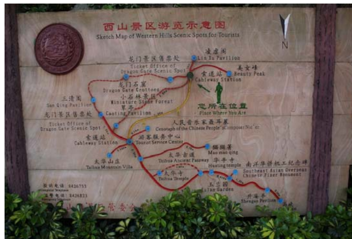
Map showing areas of interest in Xishan

Without any idea what to do and also not wishing to drag more than 10 kg of photographic equipment and the ridiculously heavy Birds of China (McKinnon), I decided to take the easy way to the summit. I took the gondola (25 RMB) to the summit area and then made my way down to wherever the trails took me. The ride up was uneventful except for a couple of Grey-chinned Minivet flitting around the tree top.