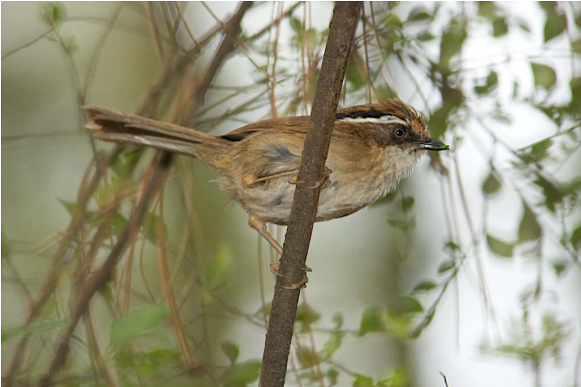
Rusty-capped Fulvetta with food

At that point, I decided to leave the area and head back to the village. I birded along the way and found more of the same species and the only new addition was a pair of Russet Sparrow near a farm and a distant Oriental Cuckoo calling away.