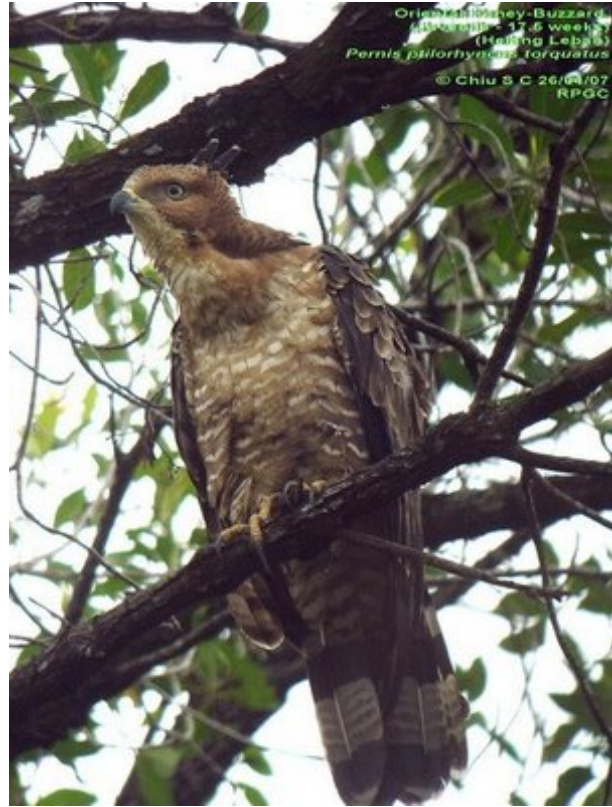
Image C: CHB torquatus race of a 17.5 week old juvenile in Ipoh, Malaysia.

In Malaysia, this subspecies was always presumed to be breeding but there were no records until 1998 when a pair of torquatus made their home within the grounds of the Royal Perak Golf Club in Ipoh, in front of birder Chiu Sein Chiong's house. This is a suburban area with plenty of mature trees, making it conducive for them to live and breed. The birds were presumed to be breeding when an adult and juvenile were first spotted in October 1998. Later, a nest was discovered in a tembusu tree ( Fagraea fragrans ) within the grounds of the club. Since then, there has been at least one nesting per year, although in 2003 and 2005 there were second nestings, with a total of ten breeding sessions recorded up to 2005.