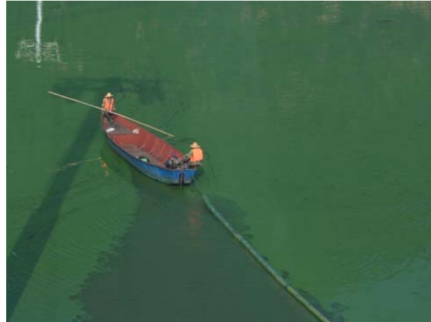
Boatmen clearing algae infested Dianchi Lake

What can you do if you have about two days to spare in Kunming? Well, after some checks, I decided to take a leisurely birding excursion to Xishan (Western Hill) as traveling out of Kunming would have involve more traveling time and two days may not suffice.