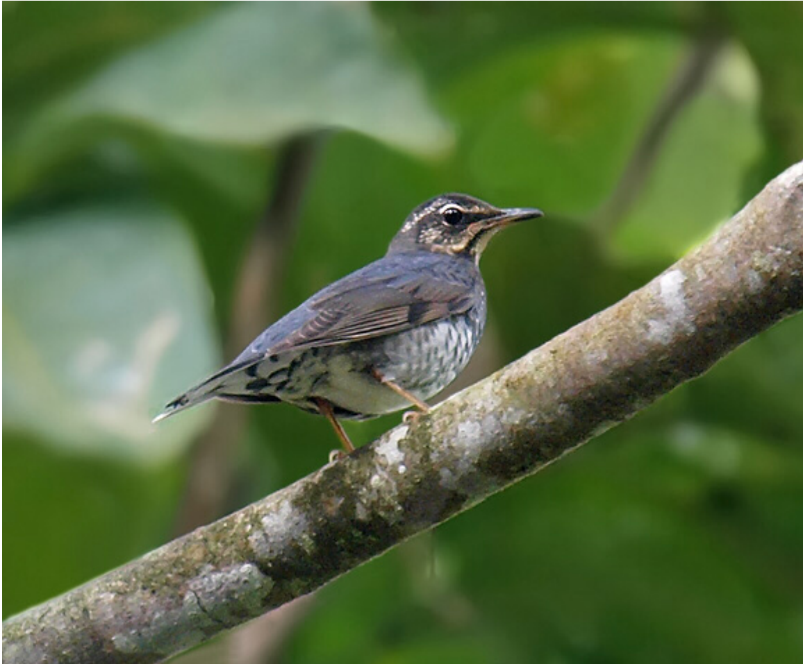
Siberian Thrush at Bunker Trail, PFR. Photo © Chong Boon Leong

1 First Winter male 26/10 photographed at Bunker Trail, PFR (CBL).