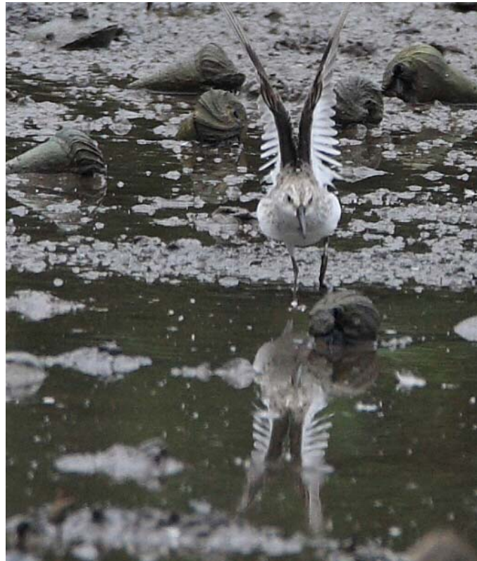
Broad-billed Sandpiper at Sungei Buloh Wetland Reserve on 26 October 2008.

1 seen and photographed 26/10 at SBWR (JiT). Also seen on same day by DA/LKS/WCC.