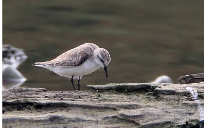
Red-necked Stint at Sungei Buloh Wetland Reserve on 26 October 2008.