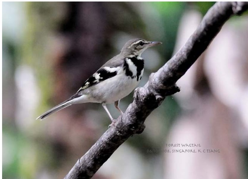
Forest Wagtail at Nee Soon Swamp Forest.

1 seen 6/10 at Nee Soon Swamp Forest (TKC)