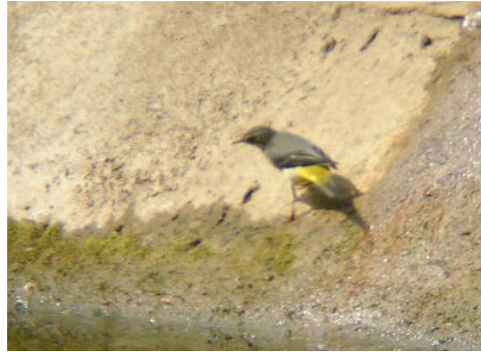
Grey Wagtail in a canal at Choa Chu Kang on 2 Aug 2008

1 observed and photographed 2/8 at Choa Chu Kang foraging in a canal (TBC). This is one of the three passerines; including Barn Swallow and Asian Paradise Flycatcher; that are normally the first to arrive at our shores. The earliest date for this species here is 18 July.