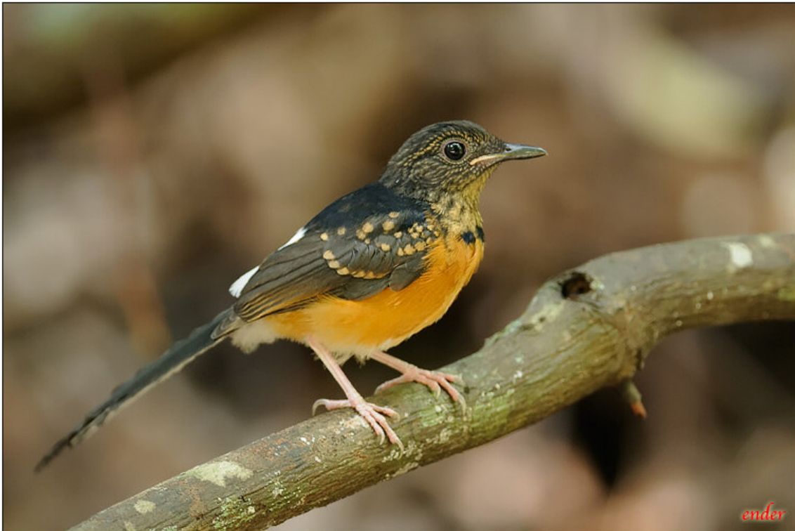
Juvenile White-rumped Shama near Jelutong Tower, Sime Forest on 3 Aug 2008.

1 adult & 1 juvenile observed and photographed 3/8 at the Sime Forest near the Jelutong Tower (En). The juvenile was seen flying around the area where an adult was also seen.