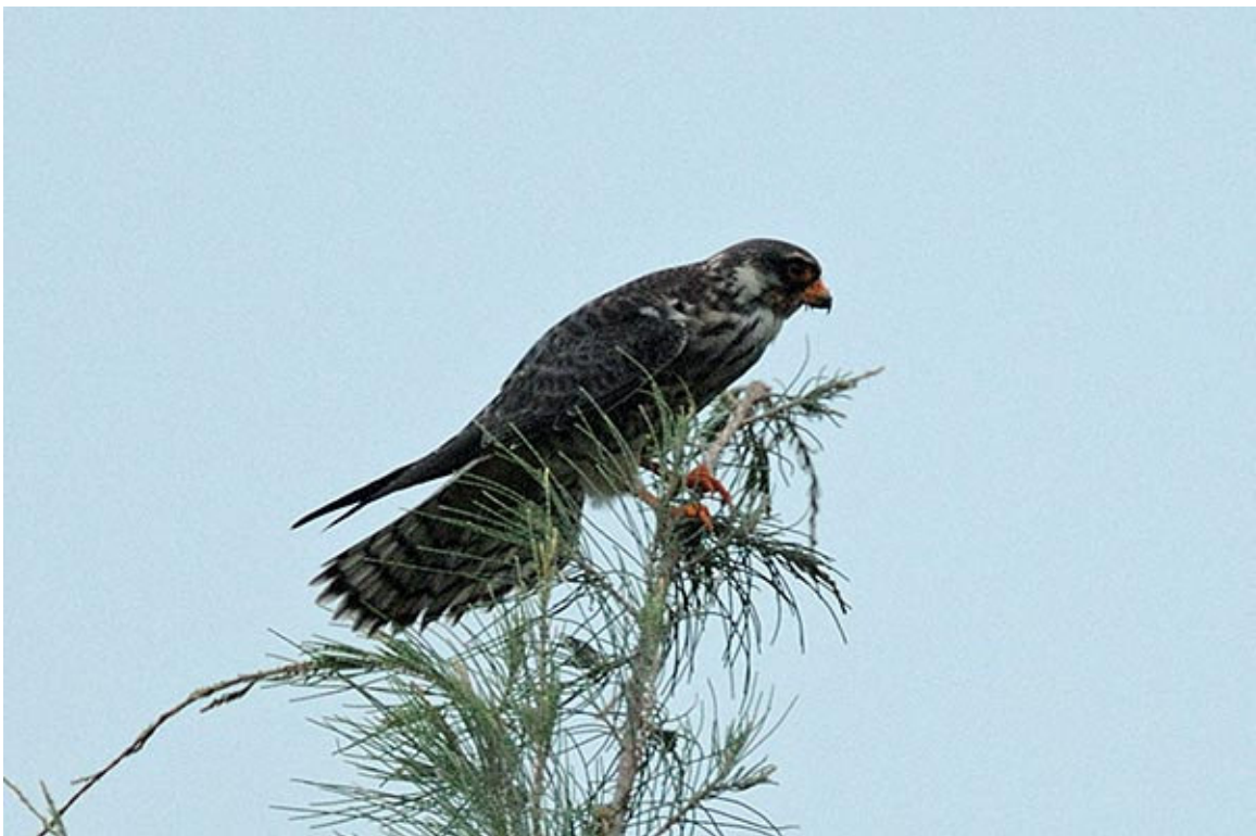
Figure 4: Amur Falcon Falco amurensis at Changi, November 2007