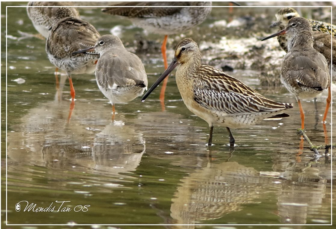
Asian Dowitcher at SBWR on 28 Aug 2008.

1 seen and photographed 26/8 at SBWR (MeT).