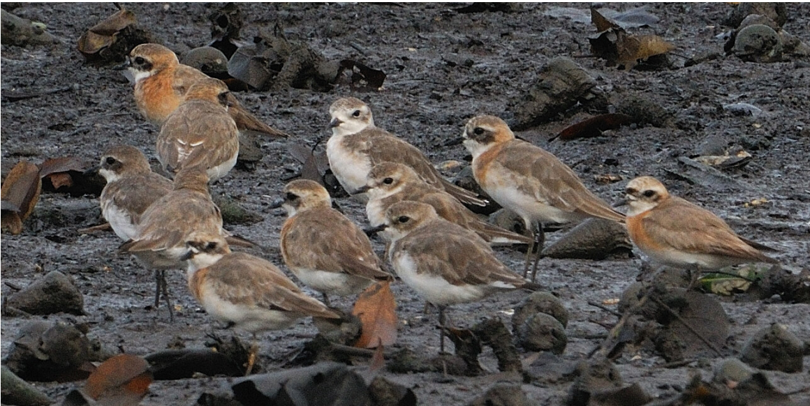
A rather pale looking Lesser Sand Plover among others at SBWR on 29 Aug 2008.

About 30 seen 9/8 at Changi, some in breeding plumage (LWT). Several seen and photographed 29/8 at SBWR. One of them is rather pale looking, with a white face and a complete collar. According to David Bakewell, It is not an unusual plumage variation as autumn sand plovers often show a pale nape which may appear as a whitish collar as well as white lores (MC). Several seen 30/8 at SBWR (FW).