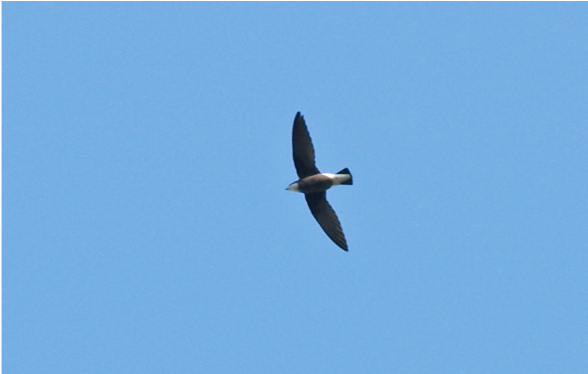
Figure 3: White-throated Needletail Hirundapus caudacutus at Bukit Timah, April 2008