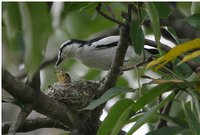
Pied Triller nesting at Kranji Carpark. Photo © Lee Tiah Khee

Golden-bellied Gerygone feeding a Little Bronze Cuckoo, Kranji Carpark. Photo © Lee Tiah Khee