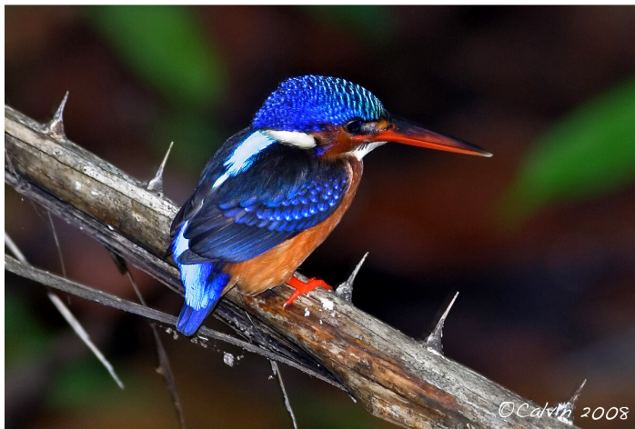
Juvenile Blue-eared Kingfisher at Lower Pierce on 17 Aug 2008.

August is the time of the time of the year, when the patient waiting of birders and photographers alike comes to an end and the migrants from the North, notably the waders, start streaming in again.