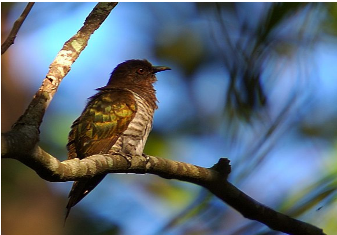
Figure 2: Juvenile Asian Emerald Cuckoo Chrysococcyx maculatus at Upper Seletar Reservoir Park, May 2006