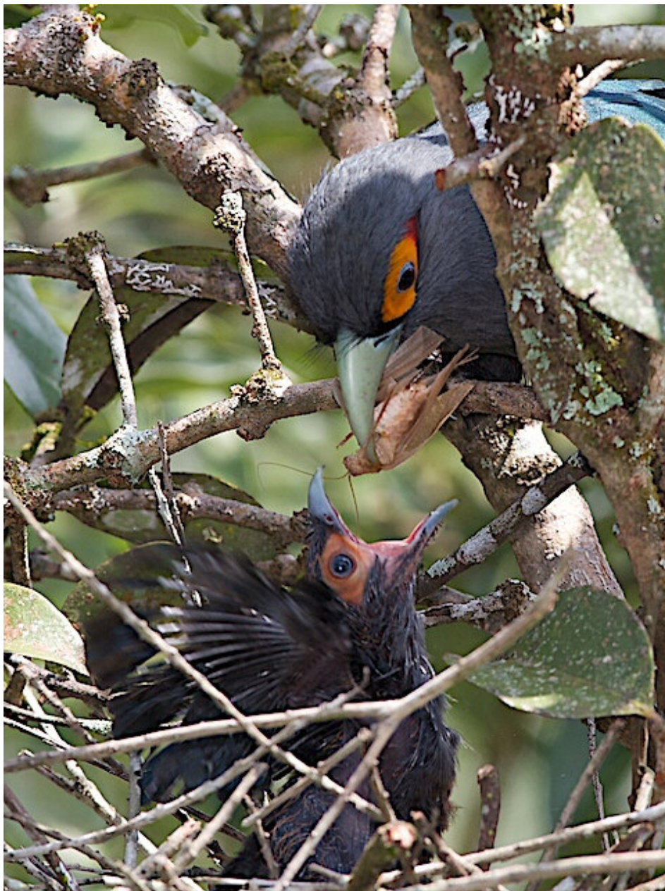
Juvenile Chestnut-bellied Malkoha fed by and adult at Mandai Orchid Garden on 22 Aug 2008.

Adults seen feeding one chick in an untidy nest of sticks at Mandai Orchid Garden, 21/8 (LKC/CF/LTK). The nest was about 2 meters high and on a Pulasan tree ( Nephelium ramboutan-ake ). Among the food items included a Flying Dragon. The chick was observed to have fledged on 27/8 (LTK).