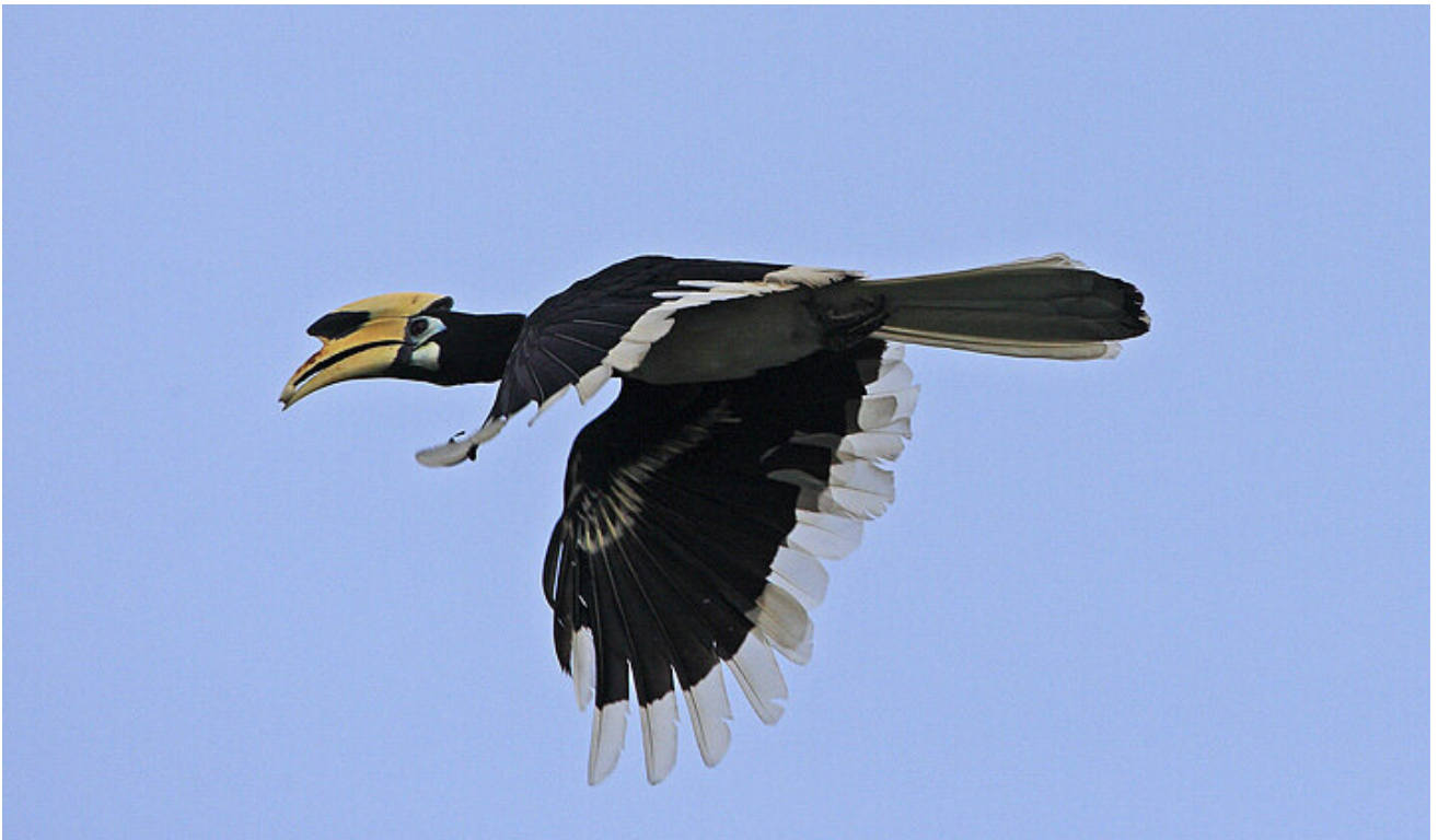
Oriental Pied Hornbill at Pulau Ubin