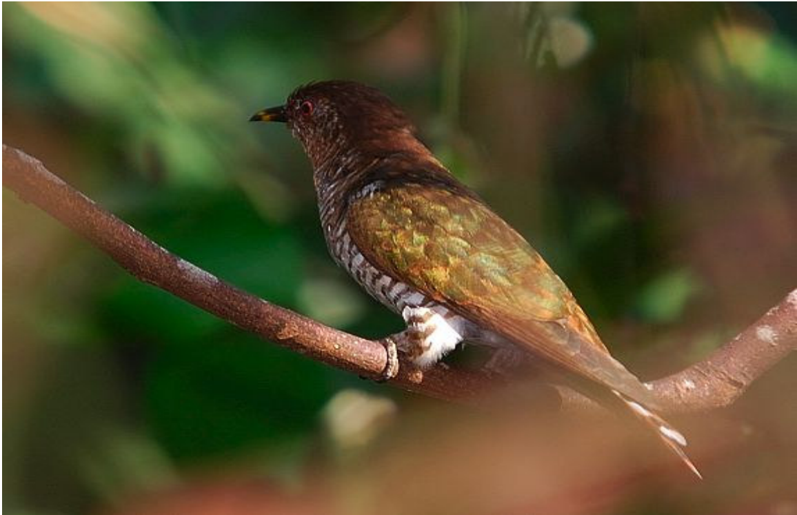
Figure 1: Female Asian Emerald Cuckoo Chrysococcyx maculatus at Upper Seletar Reservoir Park, May 2006