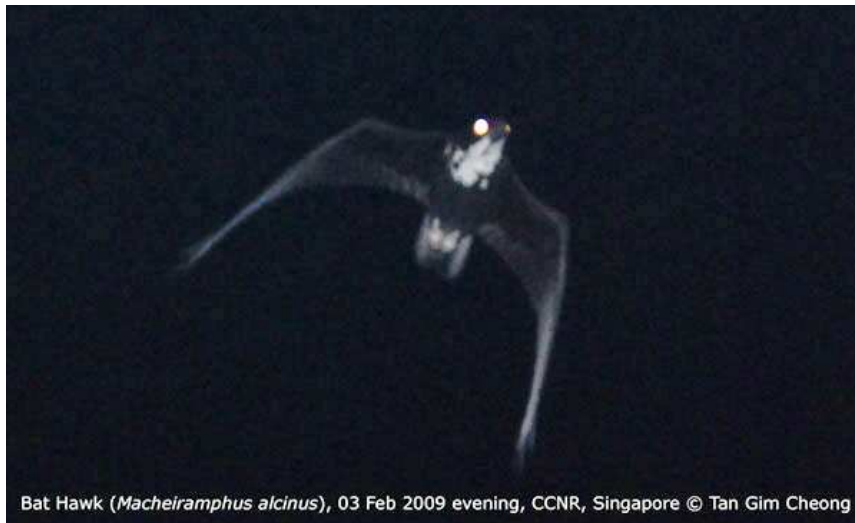
Bat Hawk ( Macheiramphus alcinus), 03 Feb 2009 evening, CCNR, Singapore