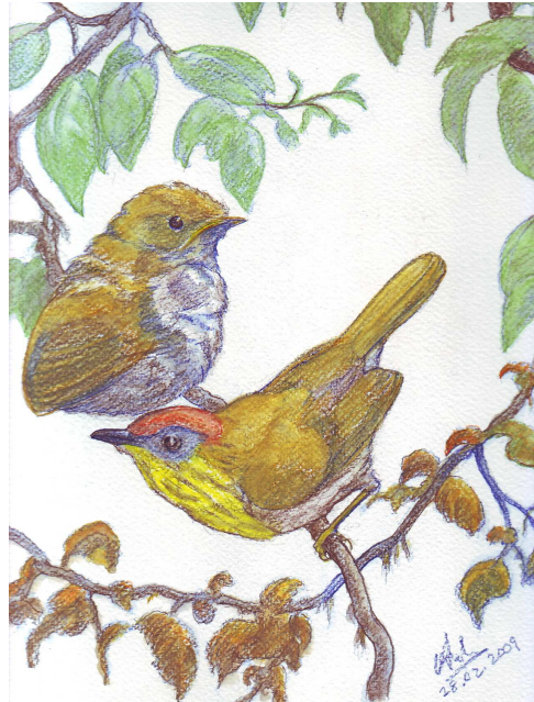
Striped Tit-babblers at BBNP on 27/02/2009

1 pair observed on 8/2 at CCFR (DA/NeK/PAH/JaR/FRw/IRw). One of the birds was carrying nest material (thin twig) in its bill while the other was twittering away. Both birds later flew down to a low bush.