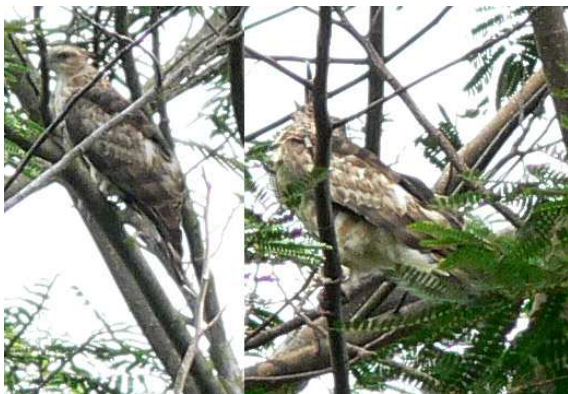
Jerdon's Baza