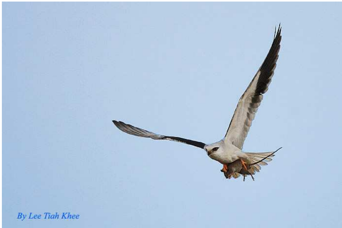
Black-winged Kite with a rat in its talon taken at Changi Cove graced this month cover

The total count for migrating raptor for February was 104 boosted by a flock of 40+ Black Bazas at Sarimbun Camp on the 17 th . We recorded a total of 9 species, 5 of which we suspected were wintering here. Again the Black Bazas topped the count with 67% of the total. We finally got the overdue Jerdon's Baza at Springleaf on the 14 th with another record from Upper Pierce on 22 nd awaiting confirmation. A Common Kestrel was a first for Sungei Buloh with a sighting of a female juvenile on 28 th . Our previous sightings of this Falco were mostly at Changi Cove. The Peregrine Falcon made its reappearance at our downtown CBD area again, with one or two wintering at Pulau Ubin. Five Oriental Honey-buzzards were observed over at Telok Blangah. The only Harrier was an Eastern Marsh reported at Tuas partly because we had no access to Changi Cove. The most exciting find for the month was the rediscovery of the Bat Hawk after 58 years! Also we had the first photographic record of a rare nocturnal raptor, the Barred Eagle Owl , taken in Pulau Ubin.