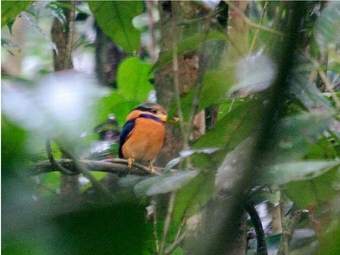
A silent Rufous-collared Kingfisher on perched at eyepoint