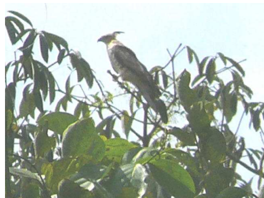
Jerdon's Baza?