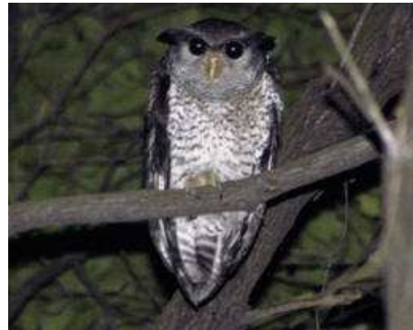
Barred Eagle Owl