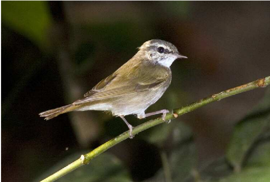
Pale-legged Warbler at Lower Peirce Reservoir on 23/2