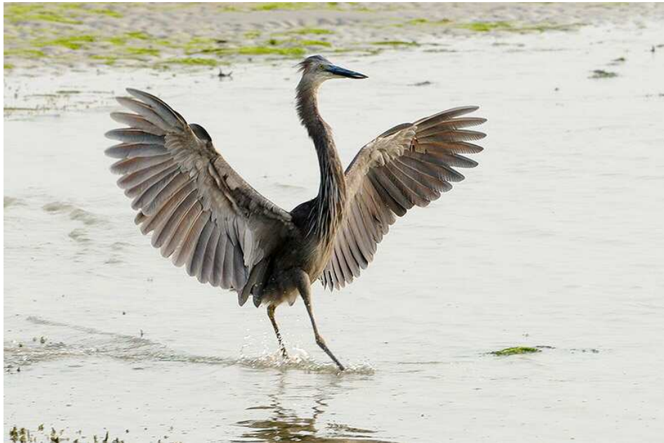
Great-billed Heron at Chek Jawa, Pulau Ubin on 14/2 by Con Foley

1 on 14/2 at Chek Jawa, Pulau Ubin (CF/LJS/LWT). It was observed catching a fish a short while after it flew in.