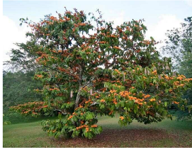
Purple-throated Sunbird feeding on a Lone Yellow Saraca at Lower Peirce Reservoir on 23/2 by Lim Kim Chuah