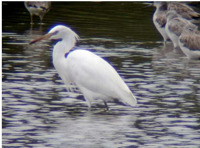
Chinese Egret at SBWR on 27/2