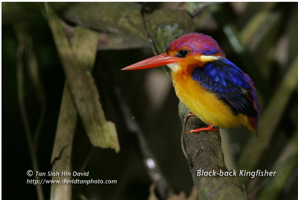
Black-backed Kingfisher at Central Catchment on 3/2

The action was focused squarely on the boardwalk connecting MacRitchie Reservoir & Lower Peirce Reservoir, up to this point an oft-overlooked and under-watched location. It established itself on the birding radar with reports of a predictable and unwary Black-backed Kingfisher which visited a sheltered cove along the boardwalk almost daily just before dusk for a bath and dinner. This individual would become the greatest ornithological attraction of 2009 thus far and hence graces the cover of this issue.