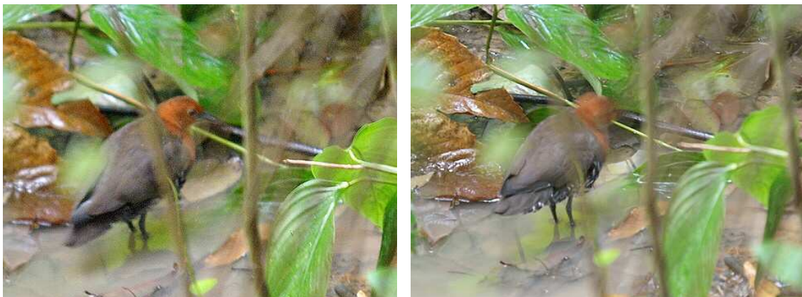
Slaty-legged Crake at Lower Peirce Reservoir on 21/2/2008

1 photographed on 21/2 at Lower Peirce Reservoir (CBL). This extremely rare visitor was last recorded in Singapore on 21/11/2000 when one was found dead at Hume Avenue. This record is being reviewed by the Records Committee.