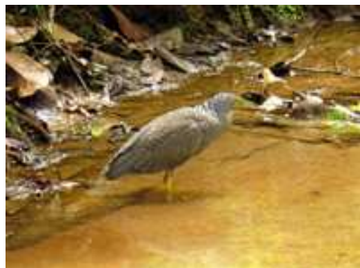
Malayan Night Heron at CCFR on 5/02/2009

1 photographed on 5/2 in BTNR (JoL). The bird was foraging in a small freshwater stream.