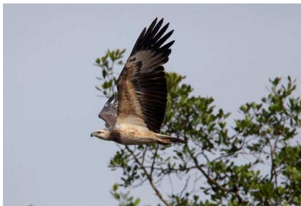
Juv White-bellied Sea Eagle by Martti Siponen

1 st One adult and five juveniles reported at SBWR by Martti Siponen