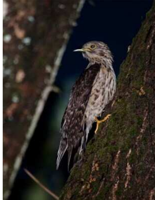
Juvenile Large Hawk Cuckoo at SBWR on 5/02/2009 by Horst Flotow

1 heard at MacRitchie Reservoir, 18/2 (LKC)