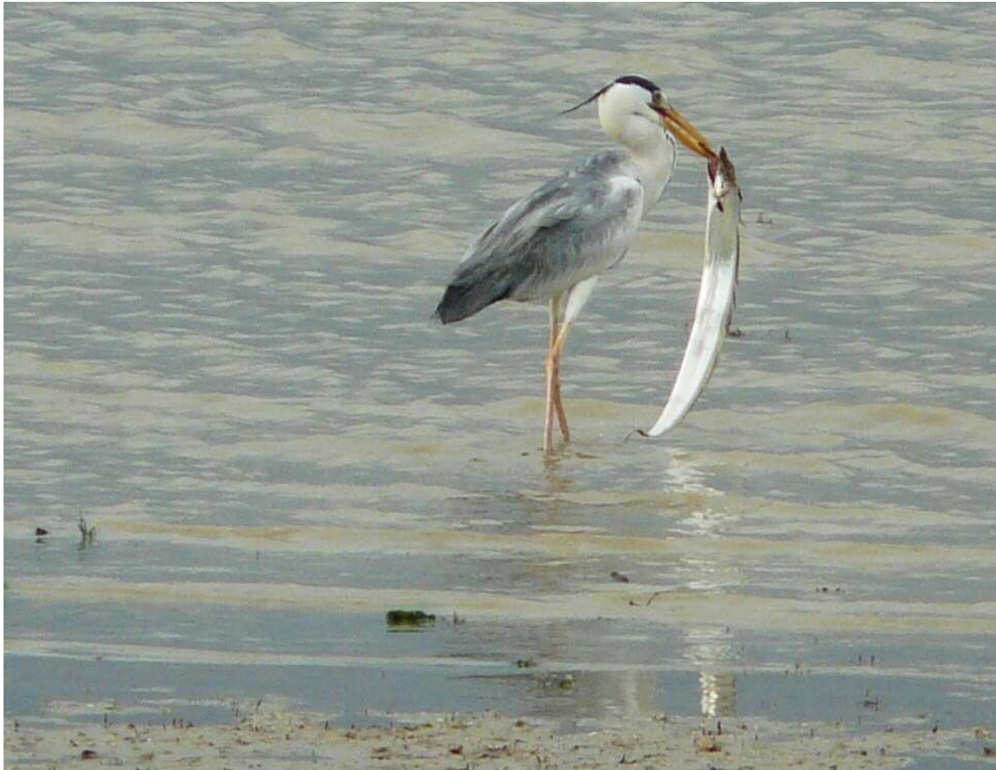
Grey Heron on 9 March at Pasir Ris Beach Park

98 counted on 15/3 during ABC 2009 at PU/LSR/PUN/SER/LH/CG/MMF/SBWR. 1 photograph 9/3 at Pasir Ris Beach Park (LJY), with a huge catch. A few seen on 29/3 at MMF (WCC).