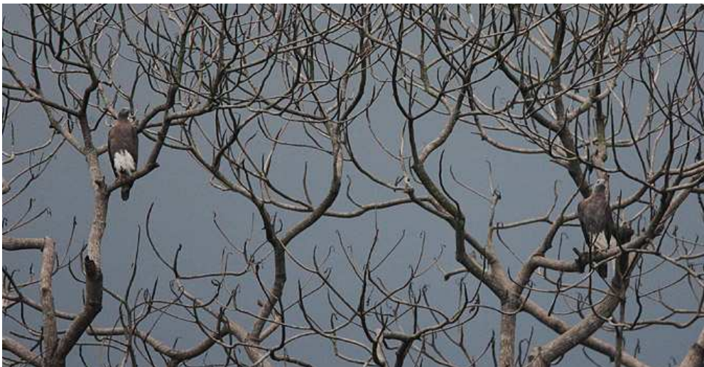
Grey-headed Fish Eagles at Lower Pierce