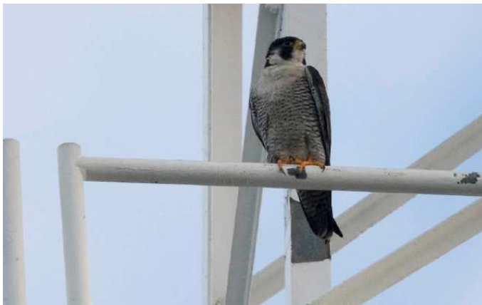
Peregrine Falcon at Pulau Ubin's Jetty