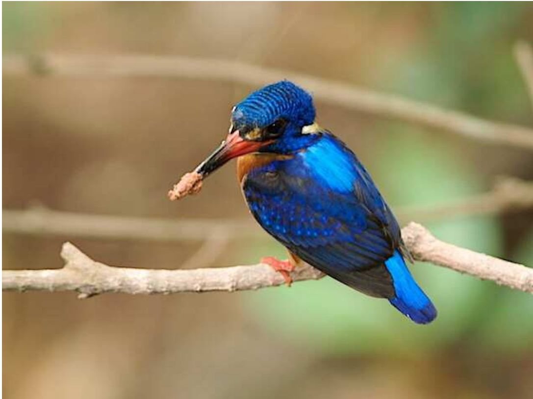
Blue-eared Kingfisher on 23 March 2009 at Lower Peirce Reservoir

After an exciting February, activity in March was slow in comparison. The boardwalk at Lower Pierce Reservoir continued to receive attention but this time besides the confiding Black-backed Kingfisher , there was the bonus of a pair of Blue-eared Kingfishers attempting to build a nest - the first time this has been observed in Singapore. Other highlights in other parts of the island included a Mangrove Pitta on Pulau Ubin, Greater and Lesser Green Leafbirds in Sime Forest, Blue-rumped Parrots at Bukit Timah Nature Reserve and White-shouldered Starlings on Pulau Ubin. This month also saw some of our winter visitors moulting into their summer plumage. This is helpful in differentiating between the two species of Pond Herons found here proving that both Chinese and Javan Pond Herons winter in Singapore.