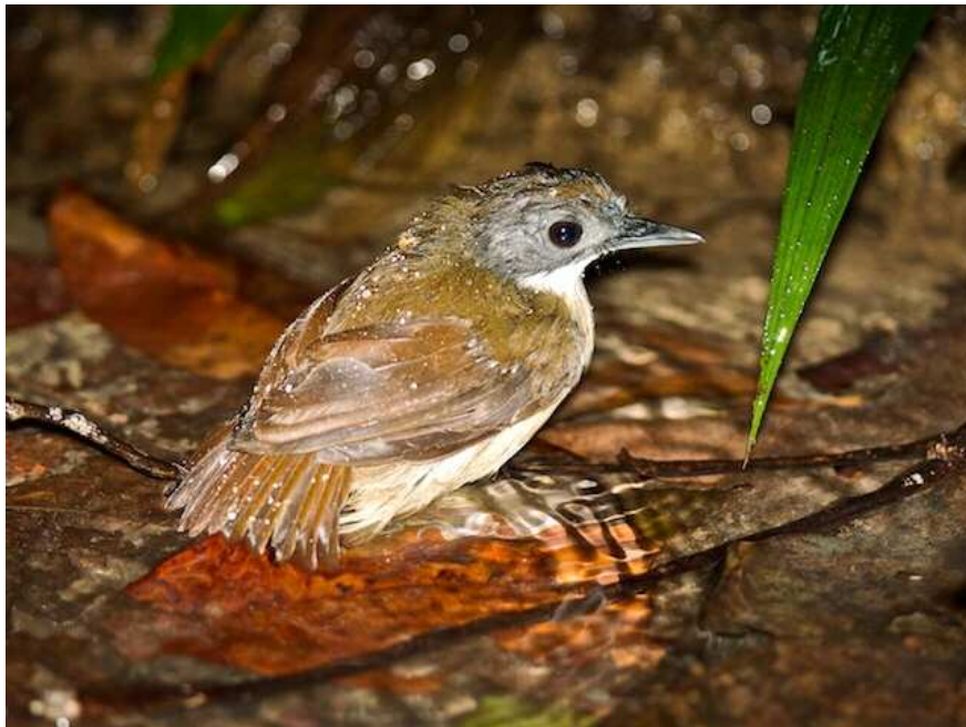
Short-tailed Babbler on 7/3 at MacRitchie Reservoir by Lim Kim Chuah

1 seen on 7/3 at MacRitchie Reservoir (LKC), taking a bath in a stream. 3 counted on 15/3 during ABC 2009 at SF.