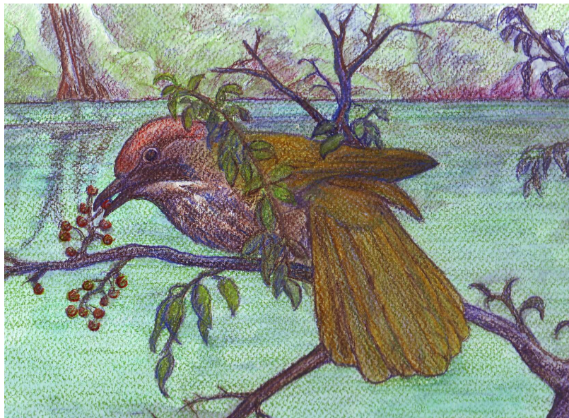
Straw-headed Bulbul feeding on a fruiting tree by the quarry pond at on 8 March at BBNP

At least 2 seen on 8/3 at BBNP (CCP) feeding on a fruiting tree by the quarry pond. 55 counted on 15/3 during ABC 2009 at BTNR/PU/TB/MF/MP/KB/POY/SBWR. 3 seen at Hindhede Nature Park on 26/3 (LKS) and 2 on 8/3 (LKC).