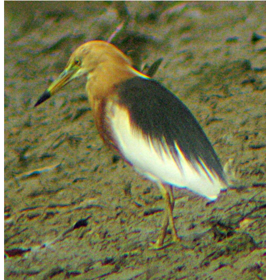
Chinese Pond Heron (left) and Javan Pond Heron (right) on 28/3 at Pasir Ris