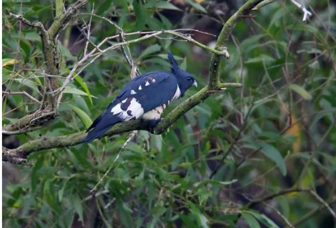
Black Baza at Japanese Gardens