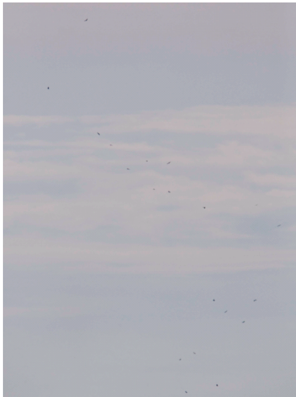
Migrating flocks of OHBs over Tuas by Martti Siponen