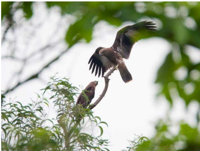
Juvenile Brahminy Kites at SBWR