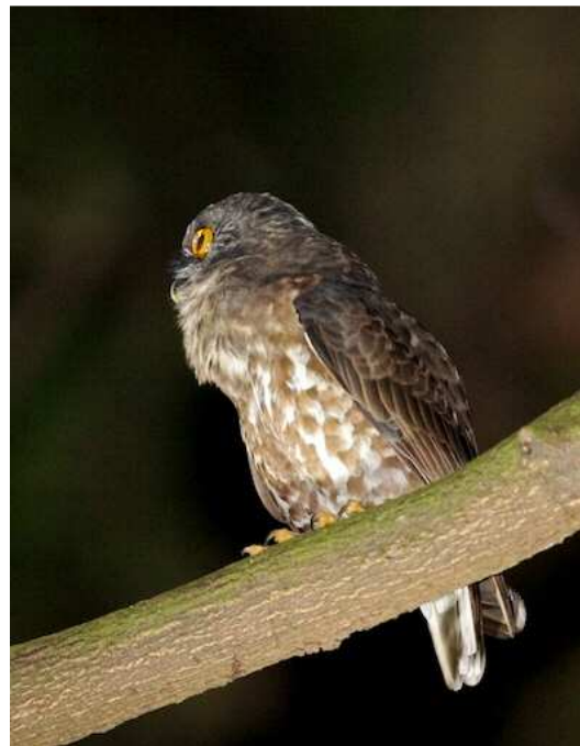
Brown Hawk-owl on 8/3 at MacRitchie Reservoir by Lim Kim Chuah

2 counted on 15/3 during ABC 2009 at BBW/POY.