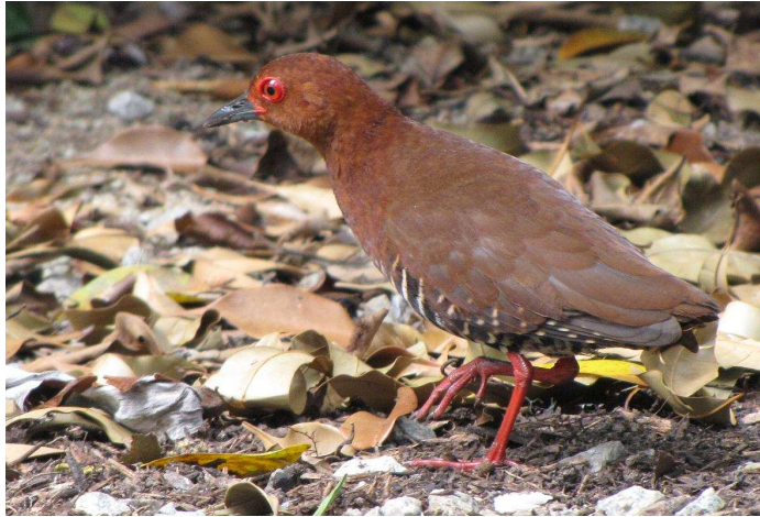
Figure 1. Red-legged Crake in Singapore Botanical Gardens

The Red-legged Crake Rallina fasciata is the only species of forest-dwelling member of the Rail family (Rallidae) in Singapore out of the eleven species known to occur locally (Lim and Gardner, 1997). Generally, most crake and rail species are more associated with waterlogged, marshy habitats rather than closed canopy forests. One other rail species, the migratory Slaty-legged Crake Rallina eurizonoides is superficially similar to the Red-legged Crake. While extremely