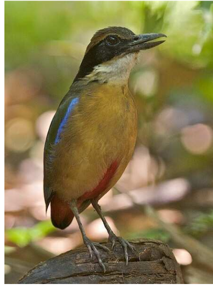
Mangrove Pitta on 24/4/09 at Pulau Ubin by Lim Kim Chuah

1 seen on 5/4 at MacRitchie Reservoir (LC/MC/LKS) and 1 male seen and 4 others heard on 5/4 at Pulau Ubin (LC/MC/LKS). At least 1 heard on 18/4 at Sime Forest (LoWH/WWC). 2 seen on 21/4 at Sime Forest (CCP/RoS). 1 seen on 24/4 at Pulau Ubin (CCP/LTK/LKC). 1 juvenile seen and 1 heard on 26/4 at Pulau Ubin (AnC/LoWH/WCC).