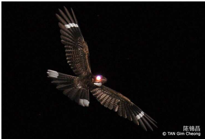
Large-tailed Nightjar at Central Catchment Nature Reserve on 21 April 2009

3 males seen on 21/4 at CCNR (TGC). They were observed to swoop around, feeding on ant-like flying insects that swarmed around the streetlamps at the edge of the forest for about 10 minutes.