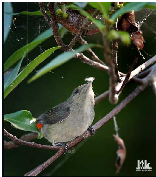
Female Scarlet-backed Flowerpecker collecting spider web on 27/4 at BBNP

A family of 3 seen on 3/4 at Toh Tuck area (DA). The young with bright orange bill was spotted first, perched on a mango tree. The adults were seen returning to it later. 1 female seen on 27/4 at BBNP (LTK) collecting spider web, presumably for nest building.