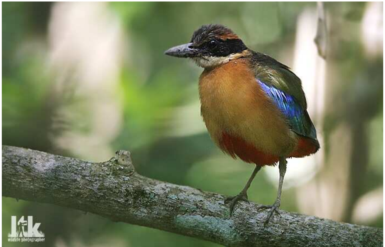
Mangrove Pitta on 24/4/09 at Pulau Ubin