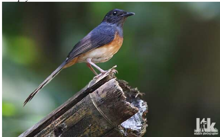
White-rumped Shama on 24 April 2009