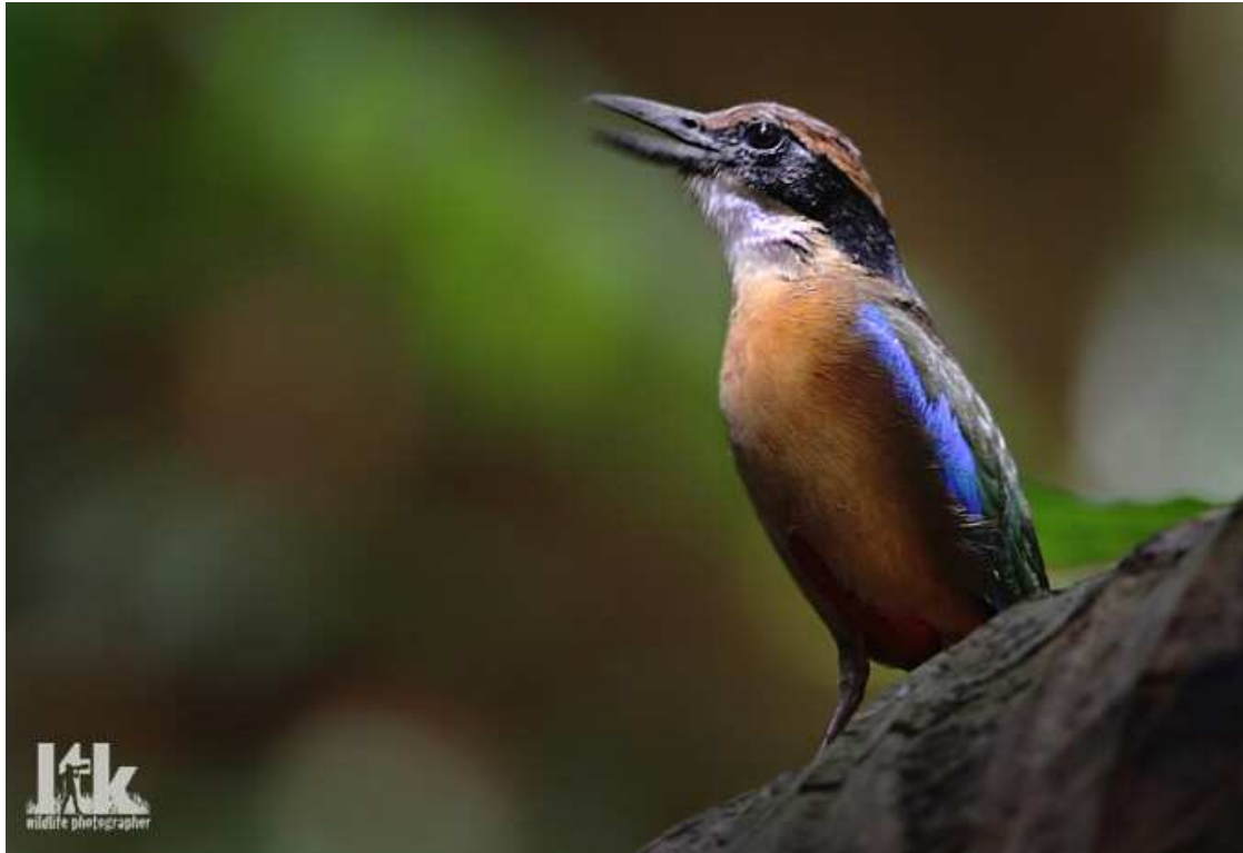
Mangrove Pitta on 24/4/09 at Pulau Ubin

April is a month of increased breeding activity as resident birds become increasingly occupied by parental duties and records of nesting for 16 species below is proof of this. The migrants too are busy preparing to fatten up for their journey home. Thus we have a bountiful harvest of species for this month signposted by the beautiful picture of a Mangrove Pitta holding its territory on Pulau Ubin. Ubin also seems to have the bulk of nationally threatened resident sightings for the month including a high count of 14 Red Junglefowls , up to three Oriental Pied Hornbills , Great-billed Heron , White-rumped Shama and Straw-headed Bulbul . Resident cuckoos were also quite vocal in April and we had Banded Bay Cuckoo , Rusty-breasted Cuckoo and Asian Drongo Cuckoo being reported throughout the month. From our catchment forests, we also had Blue-rumped Parrot , a globally near-threatened parrot, while a single Purple Swamphen showed up in wetland at Neo Tiew. Another rare resident waterbird was the Red-wattled Lapwing , which turned up at Sungei Buloh and at Changi Cove.