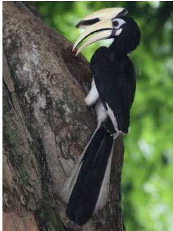
Oriental Pied Hornbill on 12/4 at Changi Village feeding the occupant by Gloria Seow.