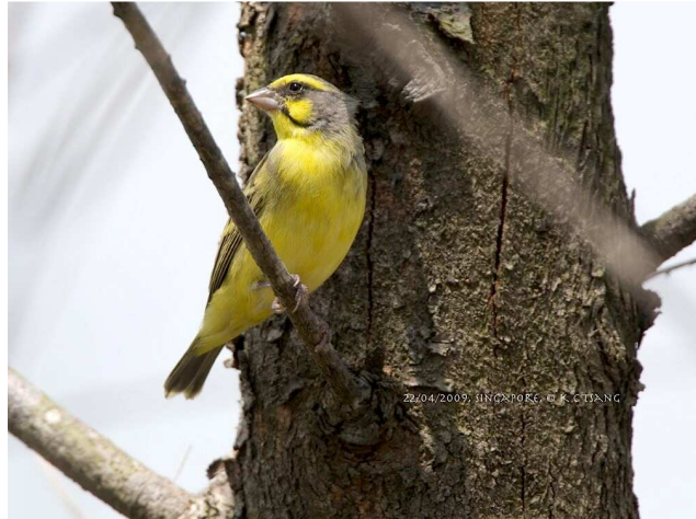
Yellow-fronted Canary at Punggol Grassland on 22 April 2009

1 pair seen on 22/4 at Punggol Grassland (TKC).