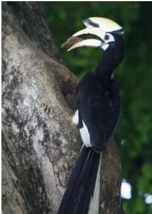
Oriental Pied Hornbill building a nest on 4/4 at Changi Village by Gloria Seow.

1 pair observed and male photographed on 4/4 and 12/4 at Changi Village (GS). A male seen on 12/4 feeding unseen female in its cavity at Changi Village (SA/LKS/LWH/LWX).