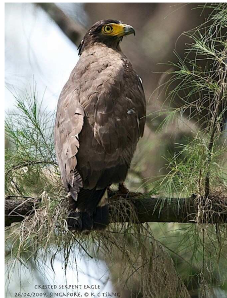
Crested Serpent Eagle at Seletar Camp on 26 April 2009

At Lower Peirce Reservoir, 1 was heard on 2/4 (SA/LKS) and 1 seen on 6/4 (DA/LKS). 1 seen on 26/4 at Seletar Camp (TKC). 1 heard on Pulau Ubin, 24/4.