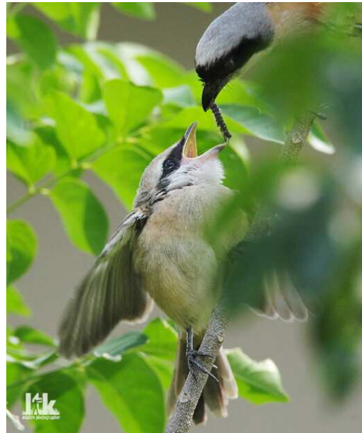
Long-tailed Shrike on 29/4/09 at a park near Compassvale Primary School

1 pair seen on 8/4 at Changi Village (HoB), defending a nest there were observed to be building for several days against a pair of Red-breasted Parakeets . Both were introduced species here. It was reported later that they abandoned their nesting. An immature seen on 26/4 at Burgundy area (DA) begging an adult for food.