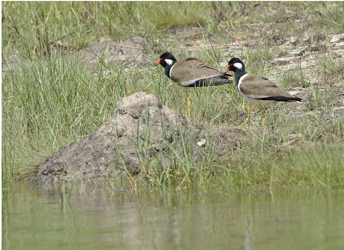
Red-wattled Lapwings at SBWR on 23 April 2009

Arguably the most interesting migrant of the month was a single Black-backed Kingfisher at Lower Peirce Reservoir which was seen on 6 th , a new late date for the species. This bird has now been recorded to winter for the first time in Singapore. Another equally rare sighting was an adult Malayan Night Heron , unfortunately found dead at Lorong Ong Lye on 25 th . Other migrants of note included Brown Shrike (till 16 th ), Asian Brown Flycatcher (till 19 th ) and Arctic Warbler (till 24 th ). Also noteworthy was a record of three Pied Imperial Pigeons on Pulau Hantu and a new exotic, Greater Bird of Paradise , to add to Singapore's ever-growing escapee list. Shorebirds remained prominent throughout the month and included Whimbrel , Common Redshank , Common Greenshank and Pacific Golden Plover .