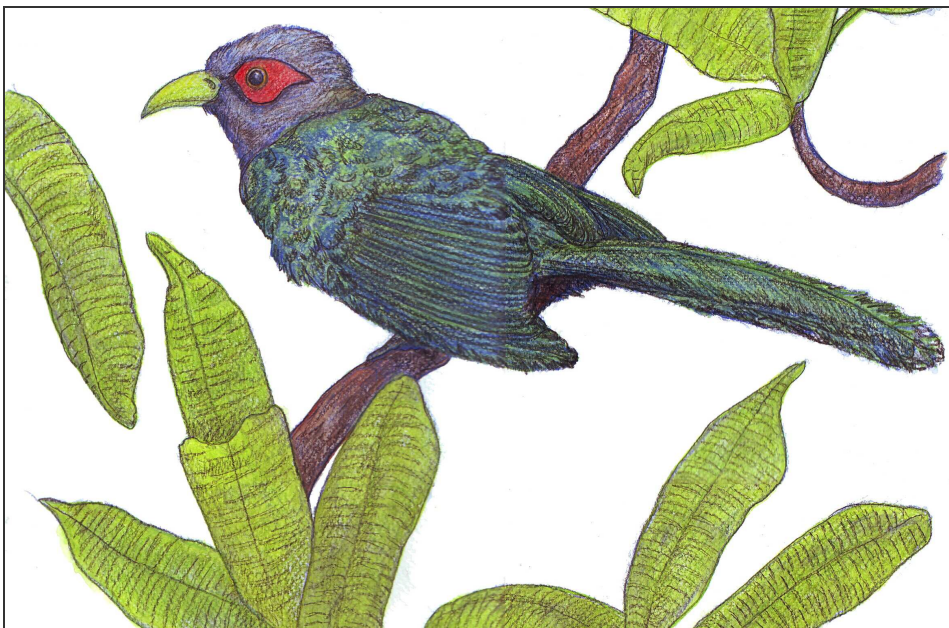
Chestnut-bellied Malkoha at Sime Forest on 21 April 2009, drying itself after a short downpour

1 seen on 21/4 at Sime Forest (CCP/RoS), preening itself after morning rain by the Treetop walk.