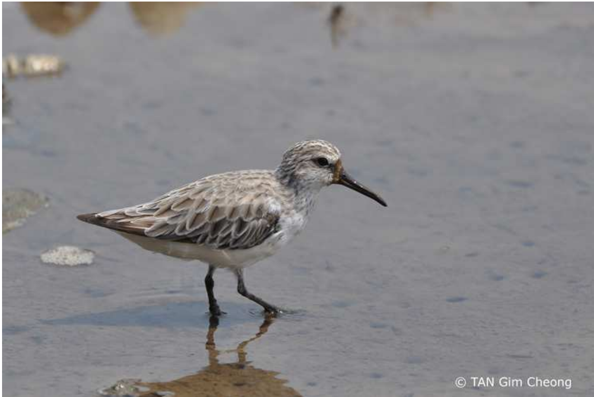
Broad-billed Sandpiper Limicola falcinellus at SBWR on 19 Oct 09

At SBWR, 1 was seen on 4/10 (LKS), 9/10 (HF/HK/LKS/SS), 18/10 (LKS/YDL) and 19/10 (TGC), and 2 on 24/10 (CWK).