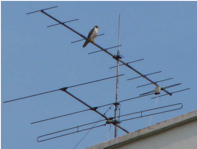
Peregrine Falcon at Bishan