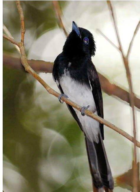
Japanese Paradise Flycatcher Terpsiphone atrocaudata at Venus Drive on 24 Oct 09

1 at SBWR, 1/10 (LKS/LWX/SA), 1 at MacRitchie Reservoir on 11/10 (LKS/DR), 3-4 at Bidadari Cemetery on 24/10 (DA/NK/PAH) and 1 at SBG on 25/10 (LKS).