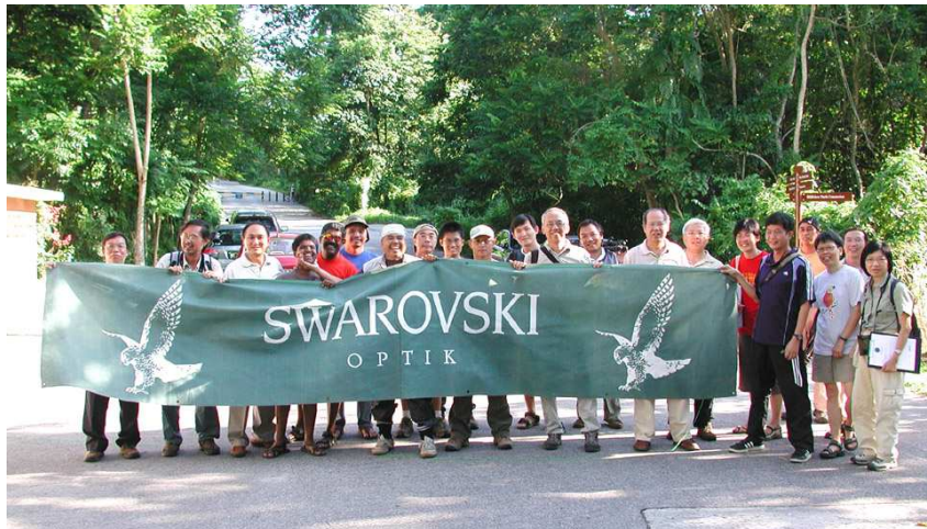
Kick off of the 26 th (Green) Singapore Bird Race at Dairy Farm Nature Park on 17 October 2009 By Sutari Supari

Ten teams participated in the 26 th Singapore Green Bird Race 2009. There were two categories: Full Race (24hrs) and Sunday Race (10hrs). The Full Race started on 17 th October at 1700hrs and ended on 18 th October at 1700hrs. The Sunday Race started on 18 th October at 0700hrs and ended on the same day at 1700hrs. For the first time, teams had to forego the luxury of private cars or taxis and use public buses and MRT instead or opt to race on bicycles.