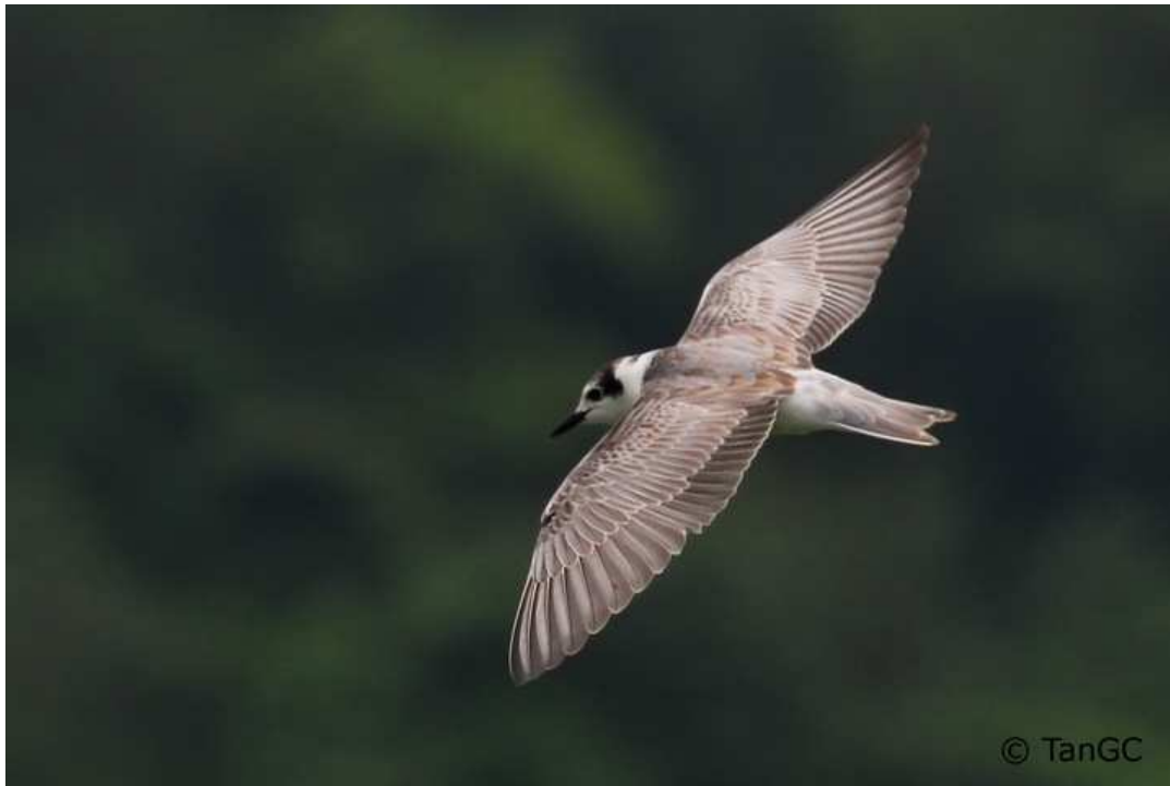
White-winged Tern Chlidonias leucopterus at Kranji Reservoir on 16 Oct 09

At Kranji Reservoir 30 were counted on 16/10 (TGC) and several on 26/10 (AC/KK/AOY).