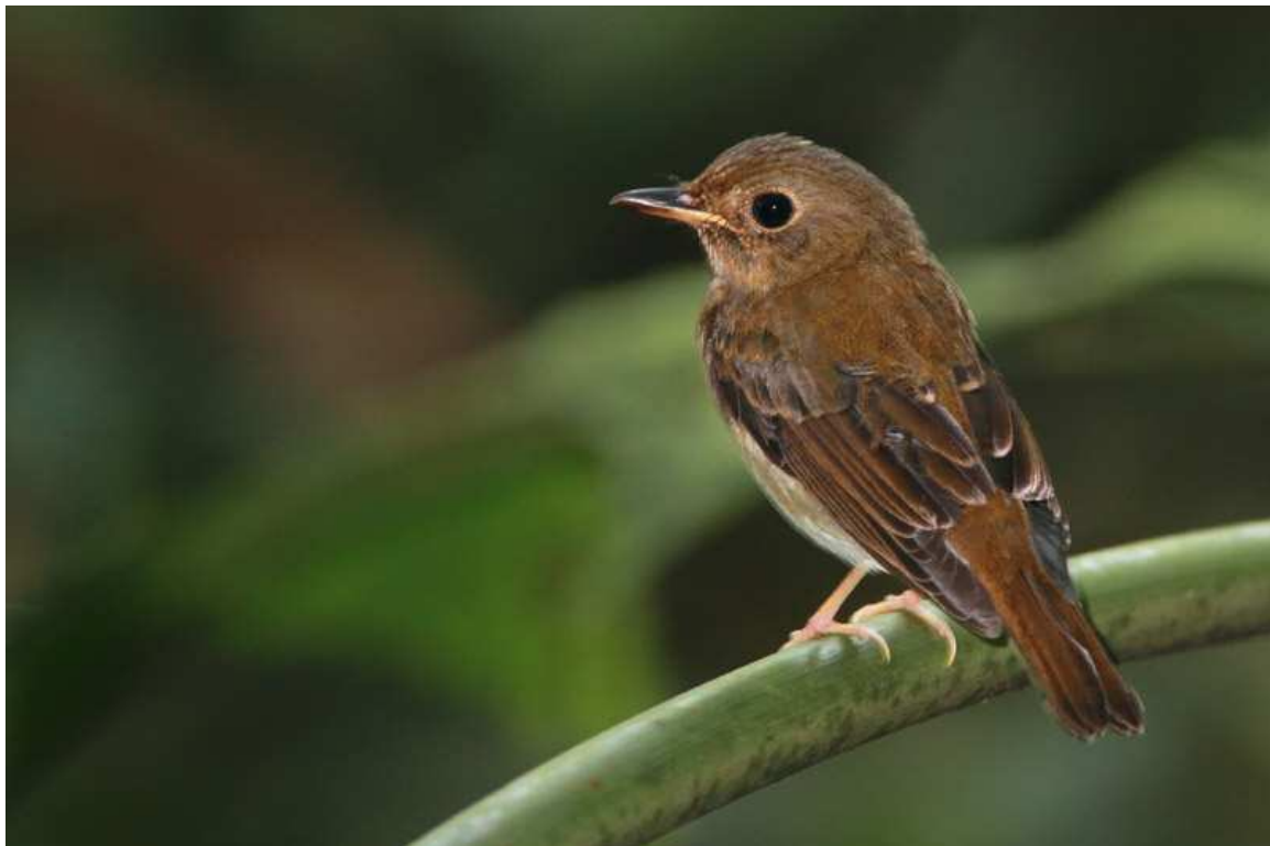
Brown-chested Jungle-flycatcher Rhinomyias brunneata at Wallace Trail on 6 Oct 09 By Lee Tiah Kee