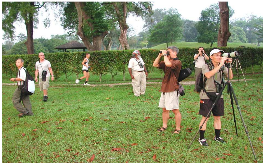
Participants in the 26 th Singapore (Green) Bird Race at MacRitchie Reservoir on 18 Oct 09 By Sutari Supari