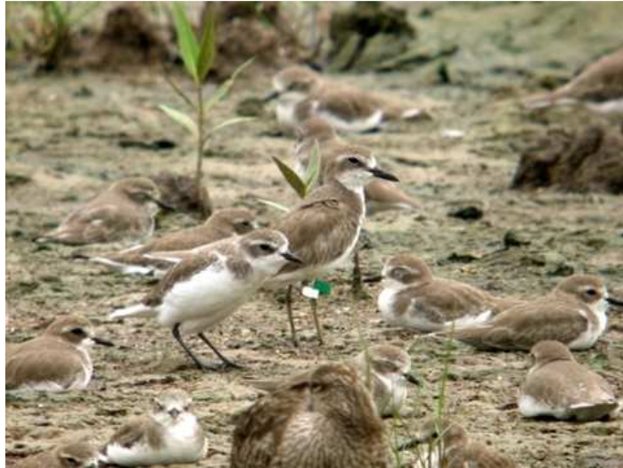
Greater Sand Plover Charadrius leschenaultii showing leg flag together with Lesser Sand Plovers C. mongolus at SBWR on 31 Oct 09

At SBWR, 1 was seen on 3/10 (LKS), 2 on 9/10 (HF/HK/LKS/SS), 1 flagged bird on 11/10 (LKS/DR) and 31/10 (DL), and 1 (unflagged) on 18/10 (LKS/YDL).