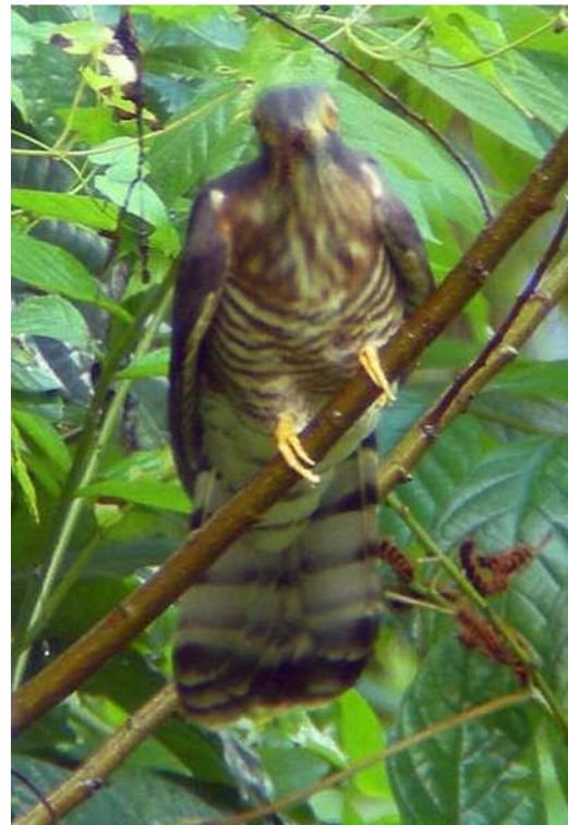
Large Hawk-cuckoo at the Choa Chu Kang area on 29 Nov

1 was seen at Choa Chu Kang area on 29/11 (TBC).