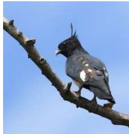
Black Baza at NTU Nanyang Crescent