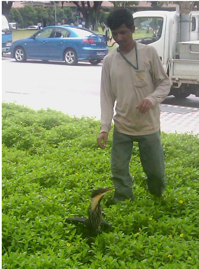
Black Bittern at Tanjong Pagar on 15 Nov by Calvin Lee

1 was found alive after crashing into a building on Jurong Island, 20/11 (LKC).