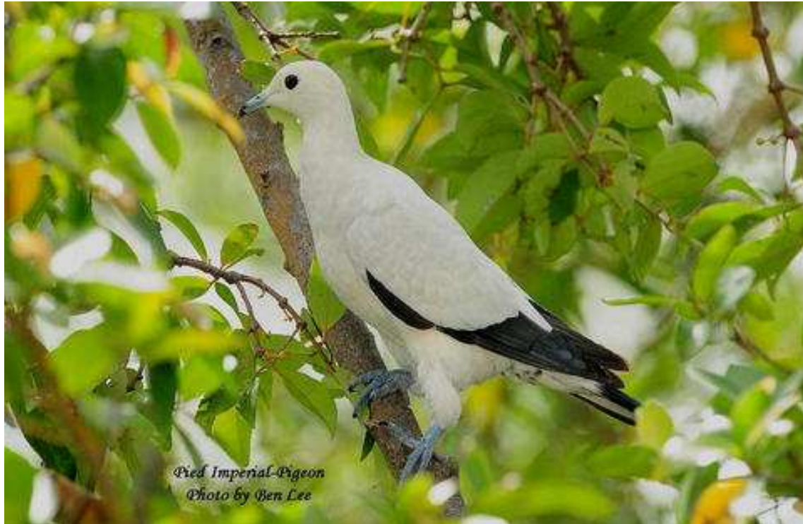
Pied Imperial Pigeon at the Chinese Gardens on 8 Nov

2 seen at the Chinese Gardens on 7/11 (SY) and 8/11 (BL) are most probably wanderers from the Jurong Bird Park