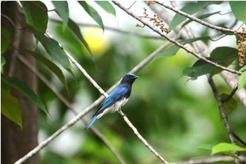
Male Blue-and-white Flycatcher at Bukit Batok Nature Park on 12 Nov by Wing Chong

1 male was seen at BBNP on 12/11 (WC). Another individual, possibly the same bird was seen at BBNP on 18/11 (LKS), 21/11 (AOY) and 27/11 (SY). Single first winter males were seen at Kent Ridge Park and Venus Drive respectively on 23/11 (SWS).