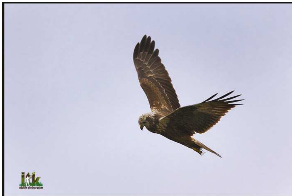
Eastern Marsh Harrier gliding over Changi Cove