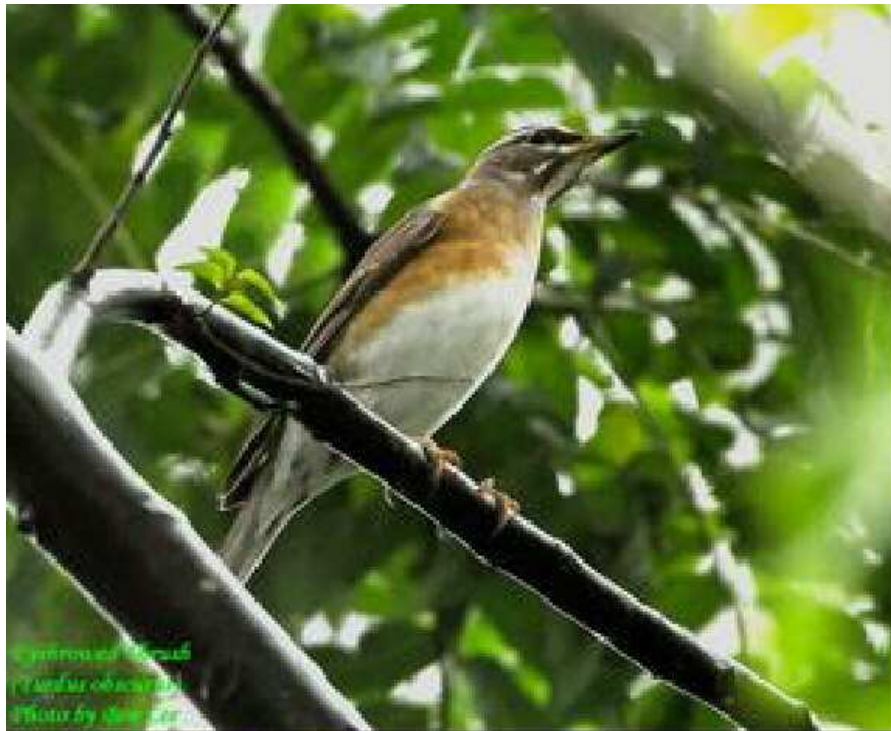
Eye-browed Thrush at Dairy Farm area on 28 Nov by Ben Lee

1 was seen at the Dairy Farm area on 28/11 (BL).