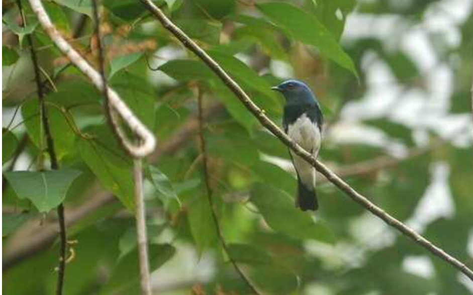
Blue-and-white Flycatchers at the Bukit Batok Nature Park on 12 Nov