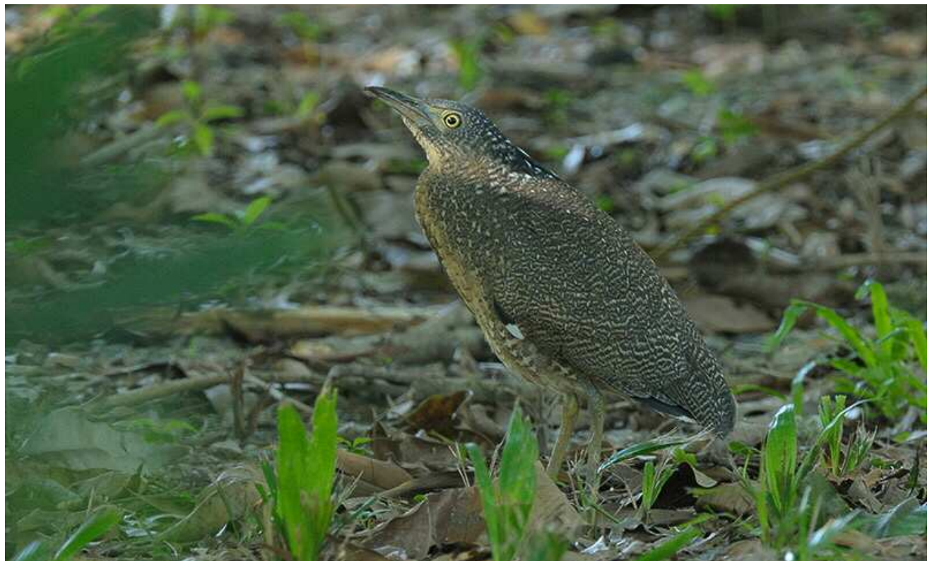
Malayan Night Heron at Jurong Lake Park on 26 November