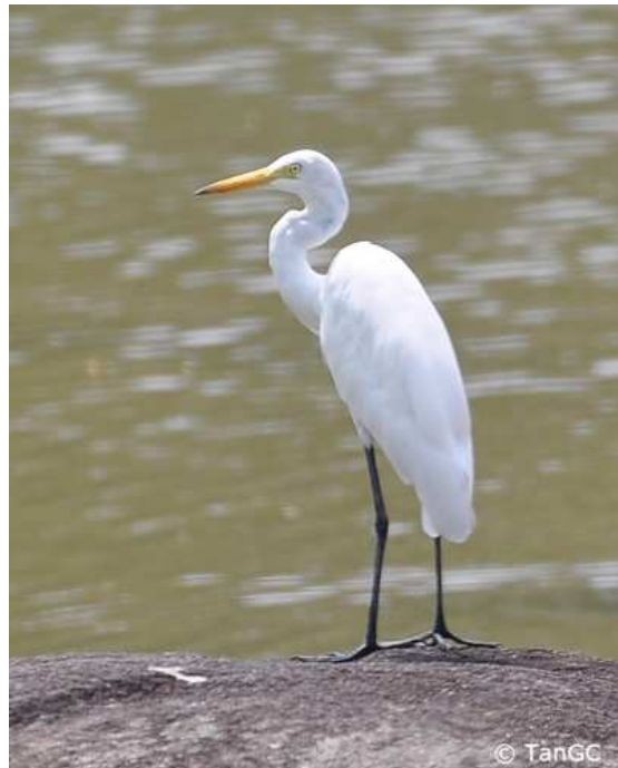
Yellow-billed Egret at the Chinese Gardens on 11 Nov by Tan Gim Cheong

3 were seen at Lorong Halus ditch on 16/11 (AC). Up to 21 birds were seen feeding in