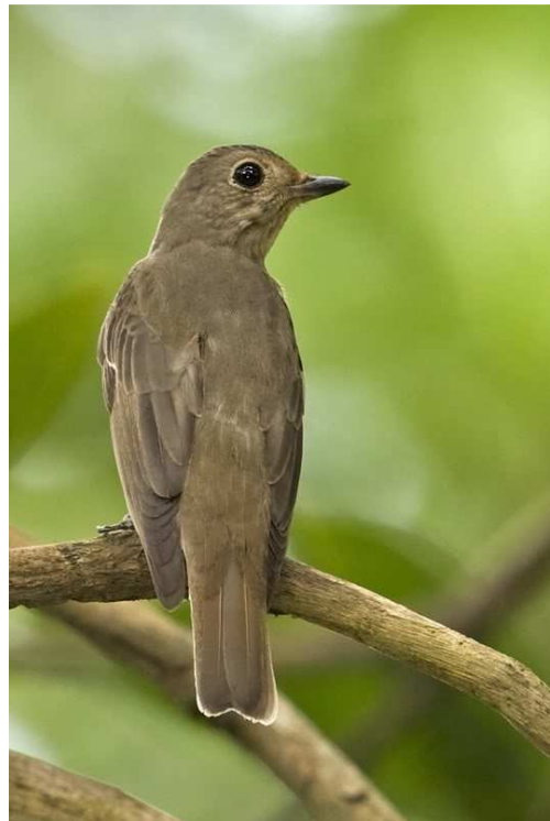
Blue-and-white Flycatcher at the Singapore Botanic Gardens on 23/12