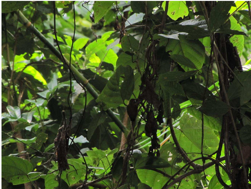
Can you spot the White-browed Piculet?

The ridge-top section of the trail was otherwise generally devoid of birds with activity primarily centred on the slope forests and the riverine forest at lower elevations. The descent allows observers a window into the activities of canopy mixed flocks because the crowns of the tall trees on the lower slopes are at eye level. In addition, one can also scan neighbouring gullies, most coated in ginger and bamboo thickets, for understorey birds. In this manner we picked out understorey mixed flocks consisting of Rufous-throated Fulvettas & Spot-necked Babblers . Other notables associating with these flocks include at least one pair of White-tailed Flycatchers and a surreal sight of a lone White-crested Laughingthrush generating enough vocalisations to sound like a small party was moving through! In the canopy above Collared Owlets were vocal and responsive. A silent flock of 7 Silver-breasted Broadbills & an even larger covey of 10-15 Long-tailed Broadbills provided a dash of colour to the various shades of green. A surprise Red-vented Barbet was also much appreciated. Lower down, hyperactive White-browed Piculets energetically drilled into vine tangles while a restless flock of Scaly-crowned Babblers was a new addition to the area list.