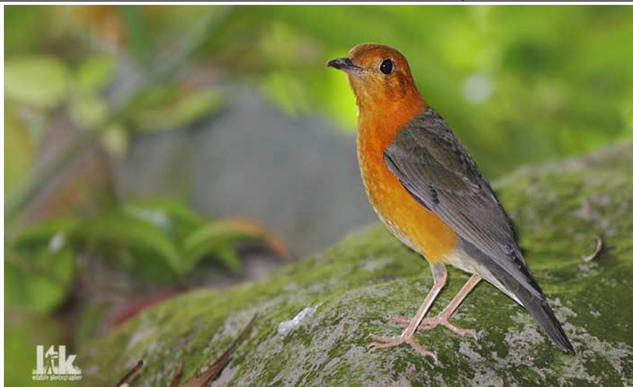
Orange-headed Thrush at Singapore Botanic Gardens on 8 December