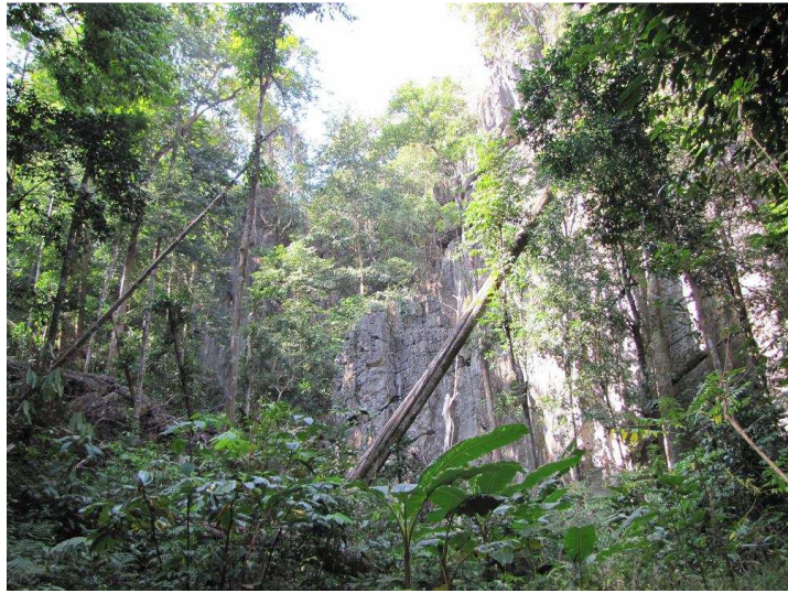
Reasonable forest at the end of KM 35 trail

We only spent one morning and one mid-morning in this area, and hence could have overlooked some specialities. One notable dip was Limestone Leaf-Warbler, recently split as a full species from Sulphur-breasted Warbler and observed here on several occasions by James Eaton in late December. During our time there, we failed to locate any in the mixed flocks, and none of us had knowledge of its vocalisations. Other notable species observed are outlined below: