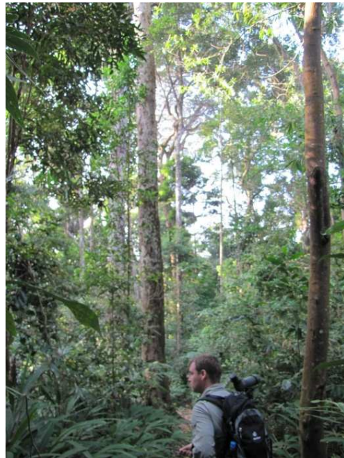
Blue-naped Pitta Country- Excellent ridge top forests with a dense understorey

As pointed out in Stijin's map, the trail makes a sharp left turn about 30 metres before the weather station itself. Right at this junction, a small trail heads off to the right. During our time there, it was anything but inconspicuous as it was the only area along the whole track which had bundles of wooden planks demarcating its entrance. The first 20-30m of the trail runs through very dense bamboo scrub but it quickly becomes more open where the bamboo meets the start of the primary forest. It was right at this point where a decisive battle was fought and lost on another dark day of birding (I am notching up a lot of such days!).