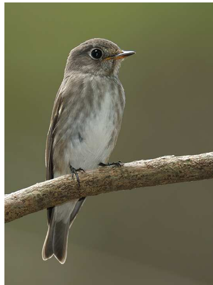
Dark-sided Flycatcher at Venus Loop on 24/11 by Con Foley