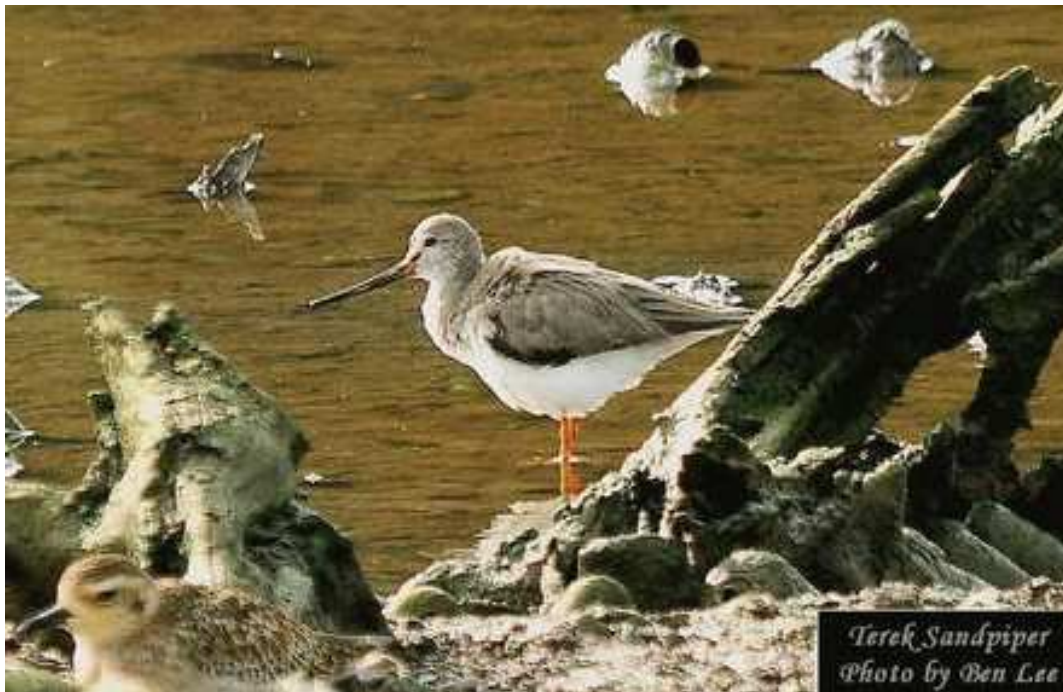
Terek Sandpiper at SBWR, 27/12

3 at SBWR, 27/12 (BL). 1 seen at Singapore Quarry on 20/12 (LKS).