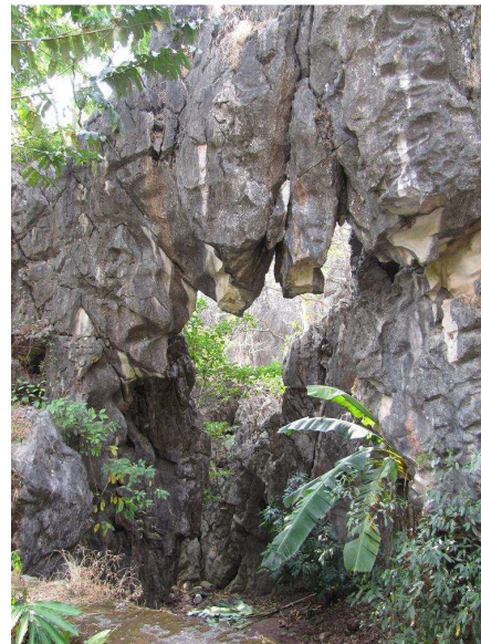
Roadside karst formation KM 32

This 4km stretch of road passes through visually spectacular limestone karsts, and is the main site for avian limestone specialities around Na Hin. The viewpoint at KM 31.5 provides a window into the vastness of suitable habitat in this region. Based on personal observations, only one flock of 5-6 Bare-faced Bulbuls seemed to occur along this stretch of road. Similarly, a flock of 10-15 Sooty Babblers appear to call this area home. Avian diversity is otherwise decidedly limited with hardly any significant mixed flocks of note. This stretch of road is also the best area to spot the globally threatened Lao Langur. Aside from the highlights listed below, the more common bulbuls and scattered sightings of Streaked Spiderhunter & a tame Green-backed Tit did their best to keep us entertained.