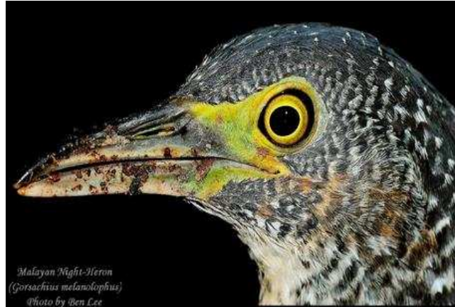
Malayan Night Heron at SBG on 19/12

1 very friendly juvenile at SBG was reported by GWHD on 3/12. It was subsequently seen by numerous observers and photographers until 28/12. The bird was extremely tame and was oblivious to the presence of on-lookers and photographers when it hunted for earthworms along the ginger garden clearings.