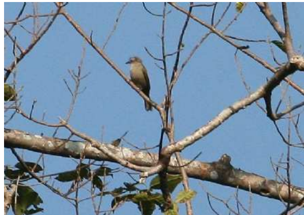
Bulbul on the Rocks! The newly described Bare-faced Bulbul