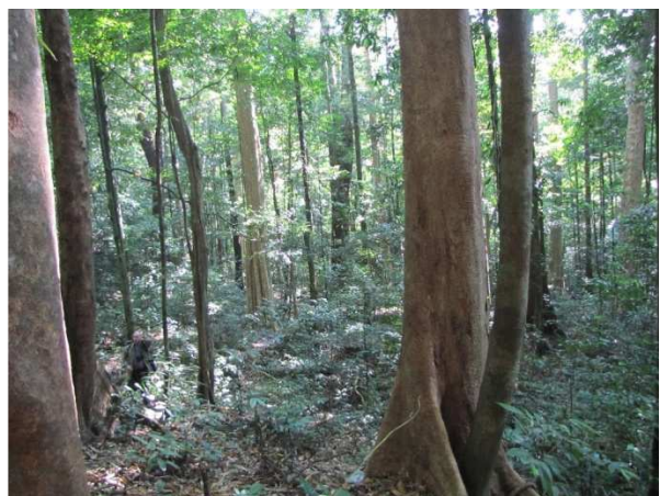
Riverine forests at the base of the slope- note reduction in understorey thickness.

Blue-naped Pitta: A species likely to be at the forefront of any visiting birder's future wish list, it is thus the first on the list. The spontaneous vocalisations of a