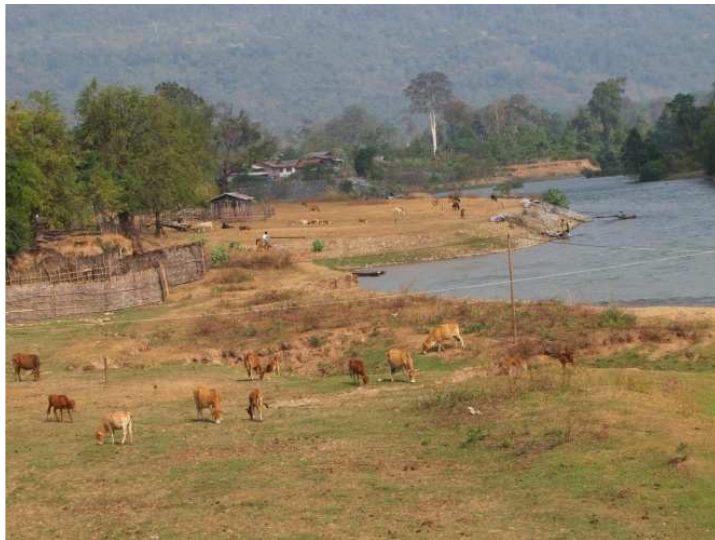
Riverine forests at the base of the slope- note reduction in understorey thickness.

As an additional aside, we had no problems requesting for breakfast at the resort at 530am before first light. The fare was simple but adequate and featured fried eggs with toast and jam.