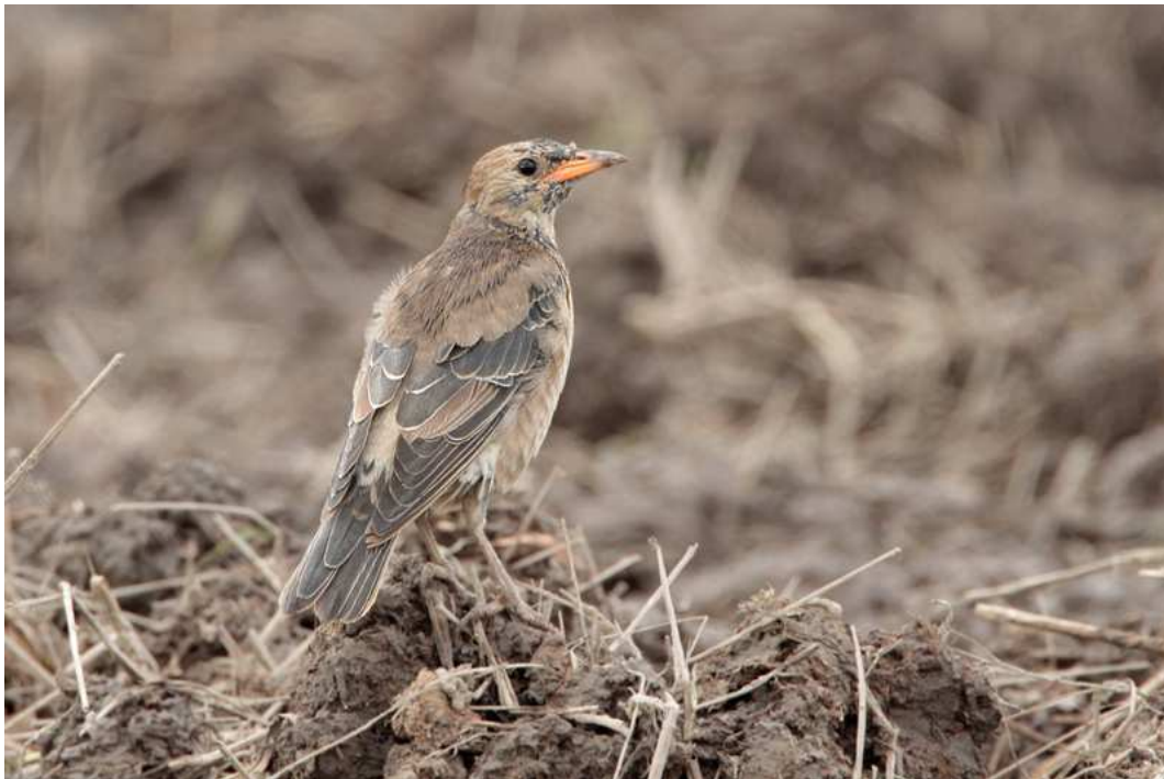
Rosy Starling at Sg Balang, 12/12 by Fang Sher Chyet

A Rosy Starling at Sungei Balang is not only a new state record but also potentially the first confirmed record for Malaysia if accepted by the Bird Records Committee of the Malaysian Nature Society.