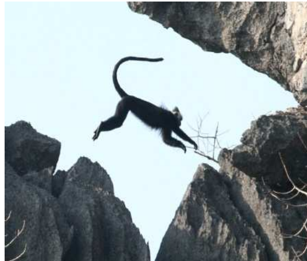
Ashley Banwell promptly became the envy of the group with this series of captures!