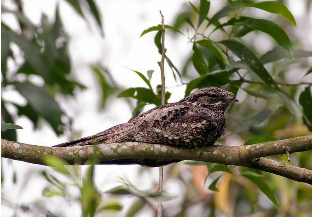
Grey Nightjar at Bidadari, 6/12