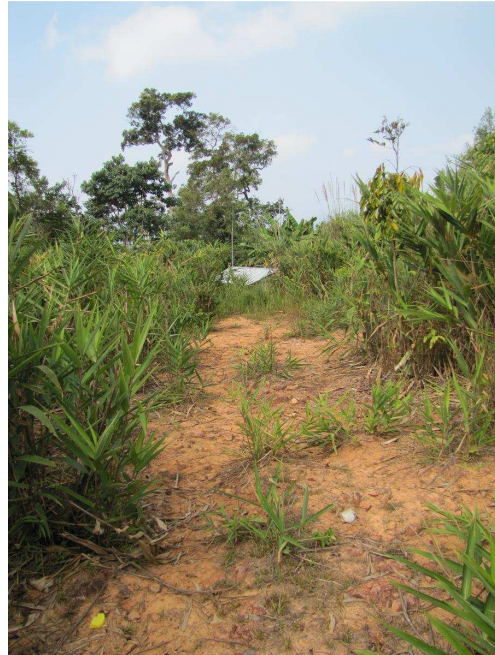
Na Hin's Weather Station tucked away in a corner of the ridgeline

Things start to get interesting around the weather station proper. Without entering the primary forest, the area where bamboo thickets meet the start of the hill forest is the exact spot where Stijin managed to tape in a single Red-collared Woodpecker in April. He reported that the bird came straight in to a personal recording and indeed, there are multiple stumps in the area