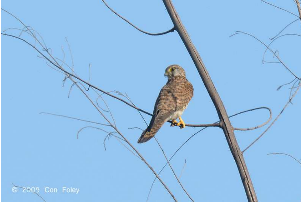
Common Kestrel (female) at Tanah Merah Grasslands