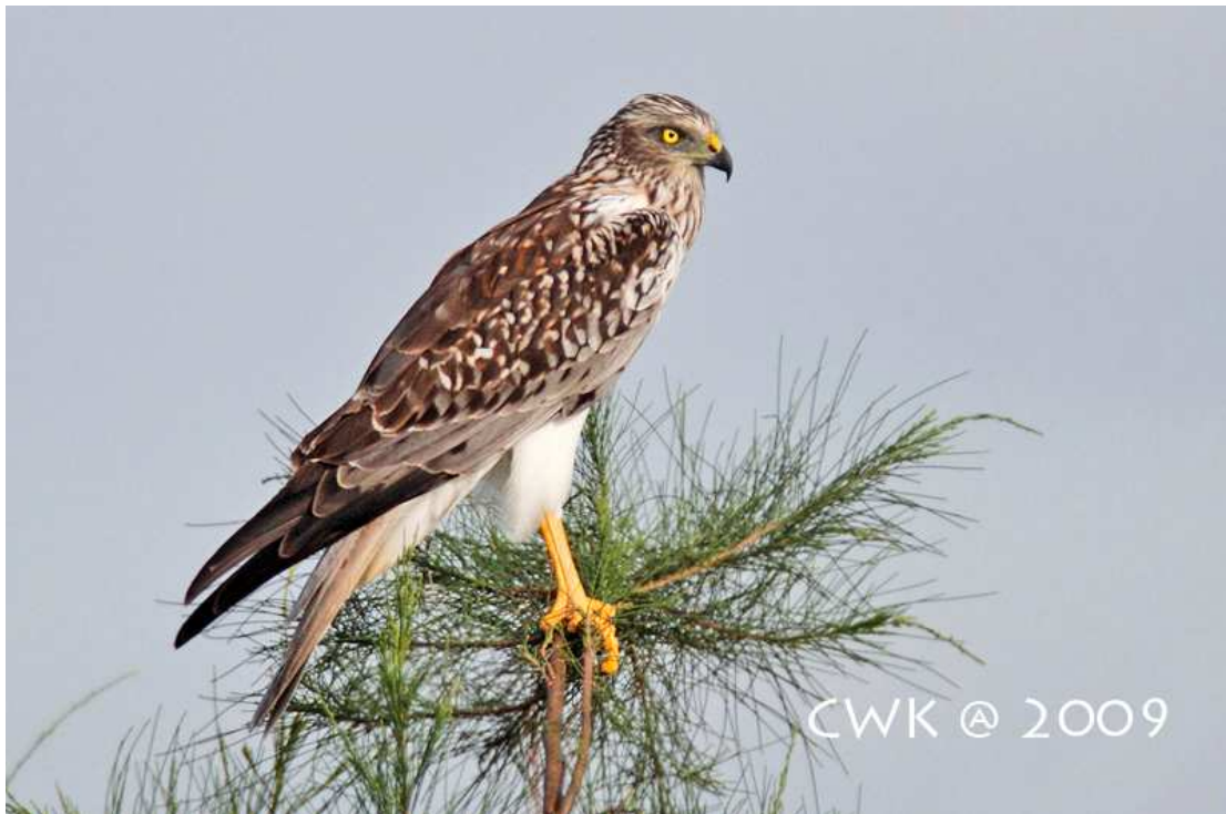
Eastern Marsh Harrier (male) at Changi

November was definitely the peak month for migrating raptors over Singapore. After the 2000+ raptors that migrated through last month, the total count for December dropped to a mere 66 from 9 species. The standouts were a Common Kestrel over at Tanah Merah and a Booted Eagle over at Seletar, reported by our top raptor team on the 5 th . The Eastern Marsh Harriers were well represented with both sexes, juvenile, sub-adults and adult birds wintering over at Changi. Both the Oriental Honey Buzzards and Black Bazas still made up the majority (75%) of all the migrating raptors. We had the first report of a pair of Crested Serpent Eagles seen together for the first time at King's Avenue. This pair may have come over from across the Straits but we hope that they will stay and breed here.