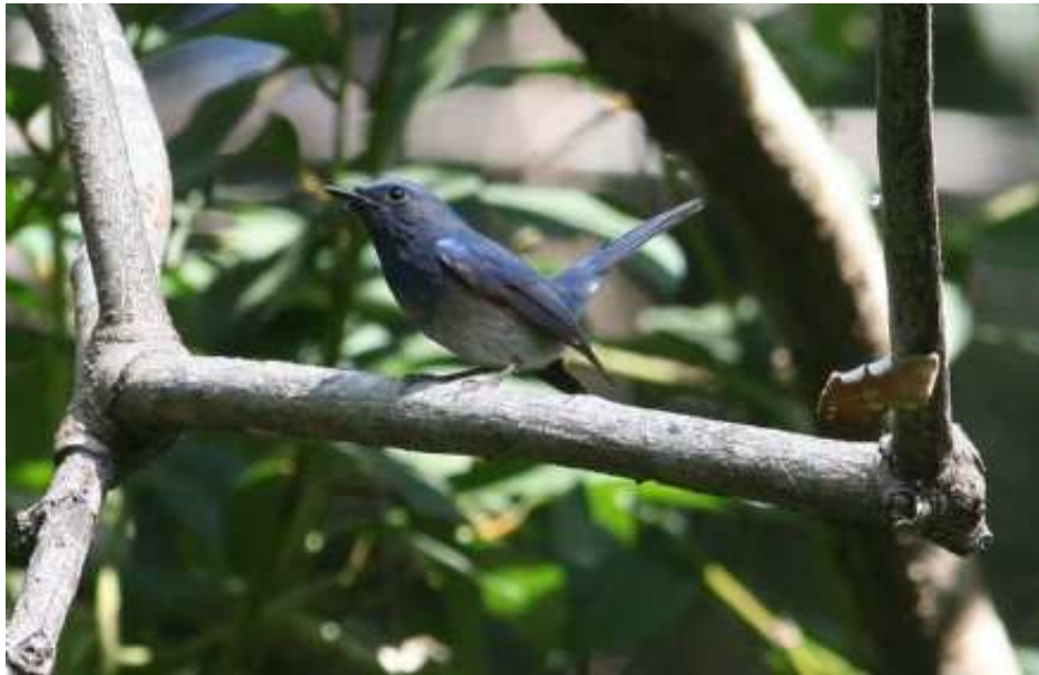
Male Hainan Blue Flycatcher

During our diurnal foray into this trail at about 11am in the morning, a single mixed flock was observed which contained at least 2 male Hainan Blue-Flycatchers and a pair of Great Ioras amidst more common species such as Scarlet Minivets & Velvet-fronted Nuthatches .