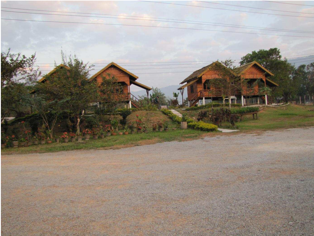
Landscape view of Sainamhai Resort grounds.

This resort is located on the outskirts of the “authentic Lao village” on the map. Its peaceful surroundings overlooking the river make it an ideal base for birdwatchers that prefer to be away from the hustle and bustle of Route 8. It is important to note that all the other guesthouses lie along Route 8 which according to Stijin now supports a lot more traffic than it used to as it is now a fully tarred highway. The resort style bungalows here should be more than adequate for birders and the restaurant is centrally located on a longhouse built on the banks of the river which allows for quite a view of the area while dining.