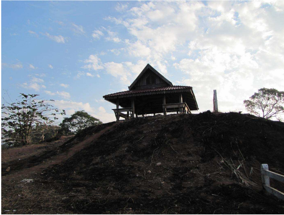
The Viewpoint, located shortly after the KM 31 marker post

This 4km stretch of road passes through visually spectacular limestone karsts, and is the main site for avian limestone specialities around Na Hin. The viewpoint at KM 31.5 provides a window into the vastness of suitable habitat in this region. Based on personal observations, only one flock of 5-6 Bare-faced Bulbuls seemed to occur along this stretch of road. Similarly, a flock of 10-15 Sooty Babblers appear to call this area home. Avian diversity is otherwise decidedly limited with hardly any significant mixed flocks of note. This stretch of road is also the best area to spot the globally threatened Lao Langur. Aside from the highlights listed below, the more common bulbuls and scattered sightings of Streaked Spiderhunter & a tame Green-backed Tit did their best to keep us entertained.