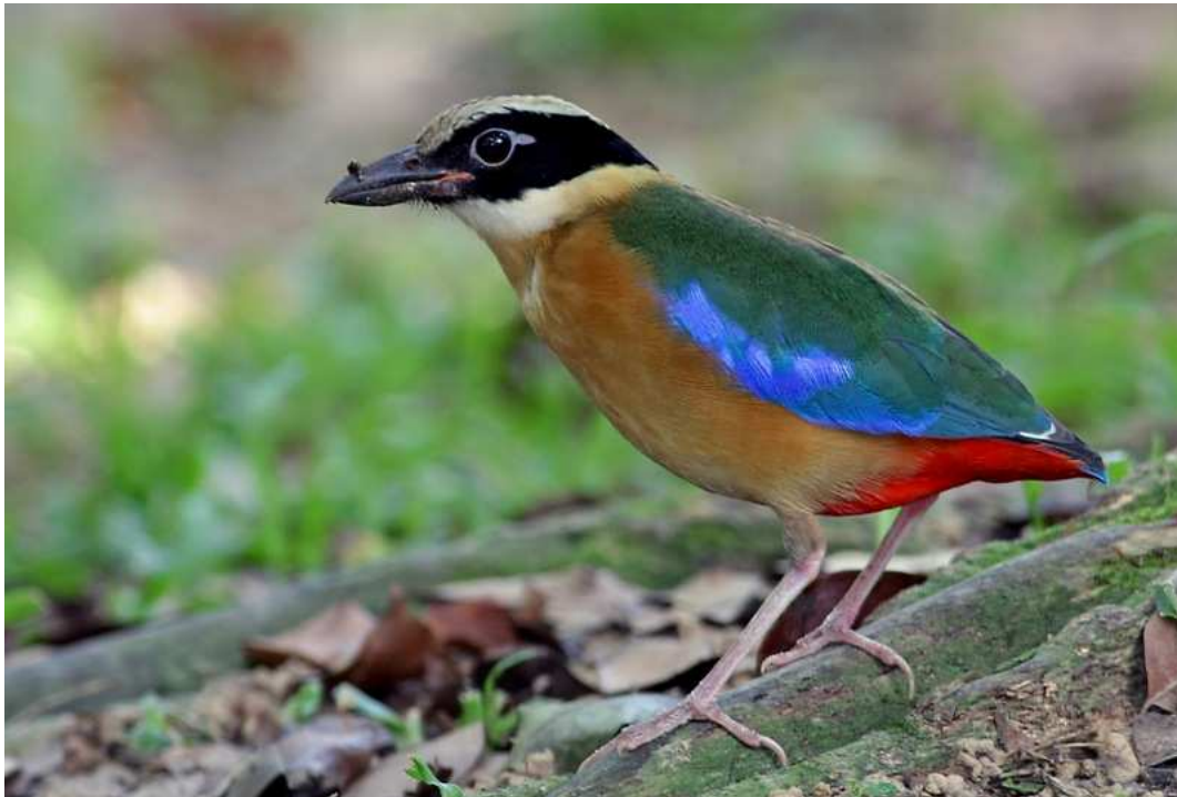
Blue-winged Pitta at Bishan Park on 15/12

1 at SBG, 5/12 (FSC), 28/12 (DA/PAH), 11/12, 14/12, 16/12 & 30/12 (all TGC). Another was found dead on Jurong Island, apparently as a result of crashing into a building, 21/12 (TBC).