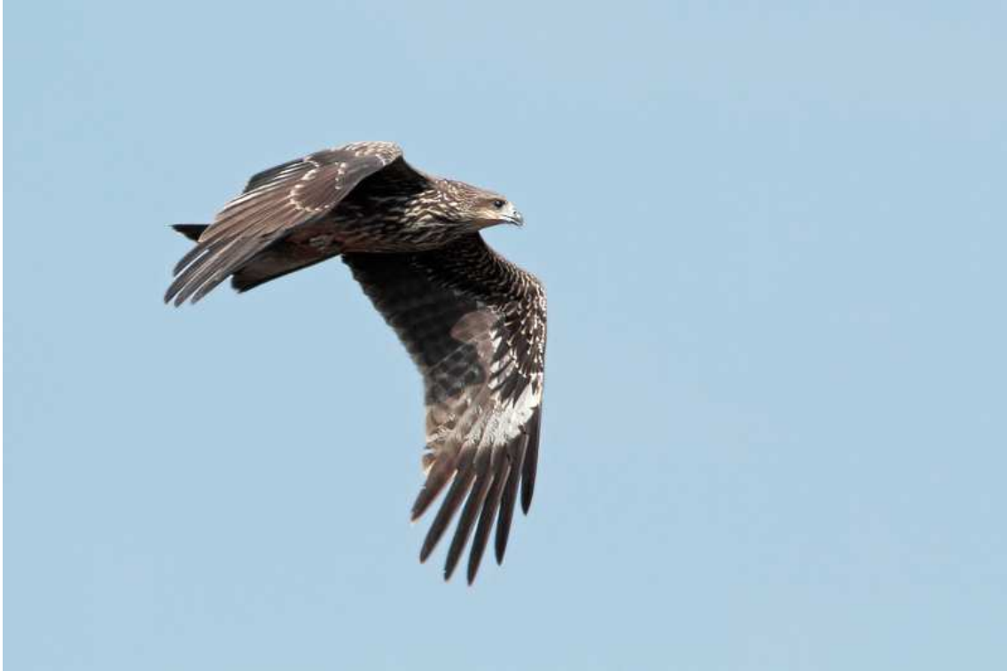
Black Kite at Sg Balang, 12/12 by Fang Sher Chyet