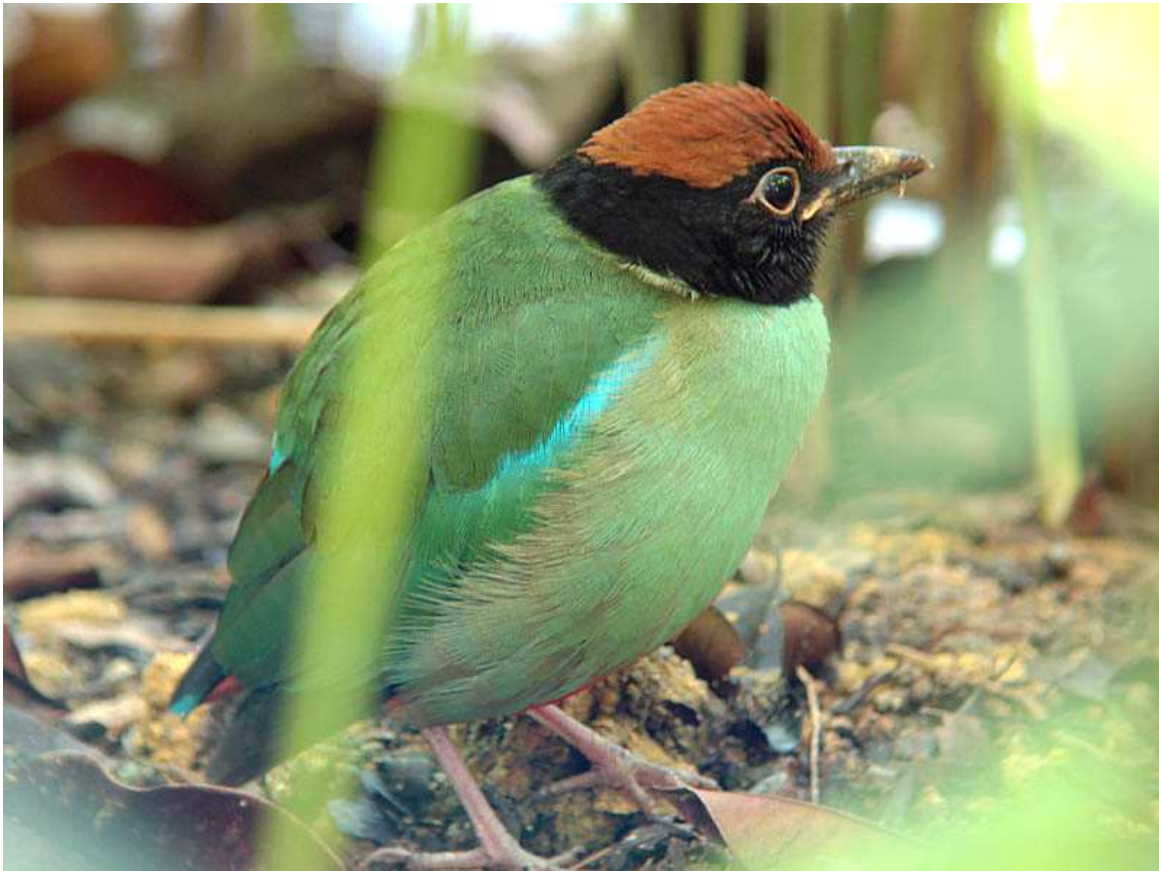
Hooded Pitta at SBG on 1 January 2010 by Akihiko & Eiko Watanabe

At SBG, 1 was seen on 1/1 (AW/EW), 2 were seen on 17/1 (JeL) and 1 on 23/1 (LKS/LWH/LWX/SA). 1 was seen hopping around in the carpark of a chemical plant on Jurong Island on 26/1 (TBC).