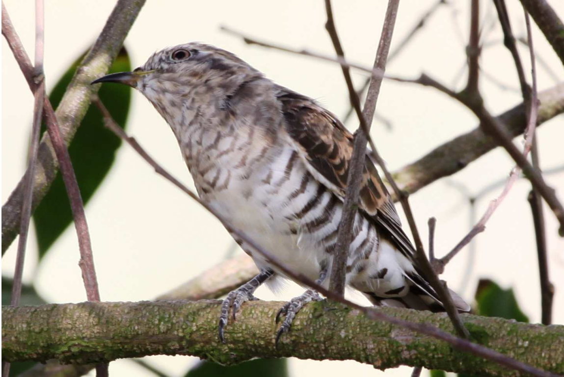
Figure 4: Adult Horsfield's Bronze Cuckoo Chrysococcyx basalis hunting for caterpillars on an Acacia tree at Tuas Grassland on 14 June 2009 (Gloria Seow)

The hunting technique of the cuckoo is worth elaborating. It would angle its head to gaze upwards at the undersides of leaves where caterpillars usually hide, wearing a somewhat quizzical expression (Figure 4). Upon spotting its prey, it would use its beak to stab-grab the caterpillar, flinging the squirming mass vigorously from side to side to kill it. Then it would swallow its meal whole.