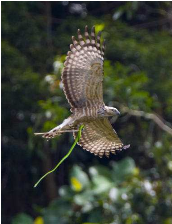
Jerdon's Baza with snake in talons at Singapore Quarry on 090110

Compared with previous years, January 2010 was a good month with 196 raptors from 14 migrant species reported. Amazingly, this number is almost thrice the total number (66) reported last month when 9 migrant species were reported. Black Bazas continued to be the most numerous at 130 birds, with a flock of 50 reported by Mike Tan at Upper Jurong. Oriental Honey Buzzards came in second in terms of numbers with a total of 27. Three migrant species were recorded for the first time this season. January 2010 also marked the month when a good haul of 3 rare sedentary (resident/non-breeding visitor) raptors were reported.