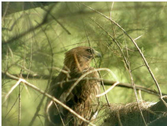
Booted Eagle, dark morph, at Seletar West