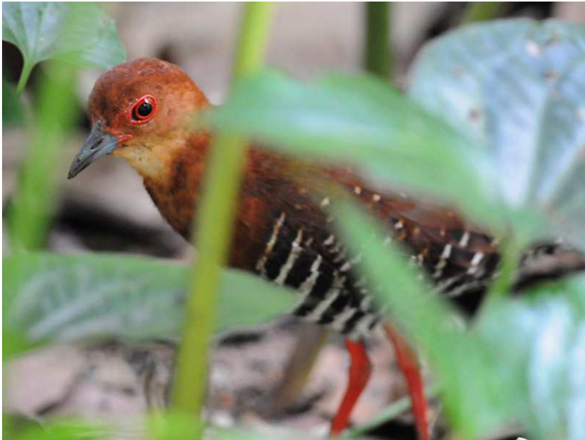
Red-legged Crake at SBG on 1 January 2010

1 photographed at SBG on 1/1 (AW/EW). See also Nesting Report this issue.