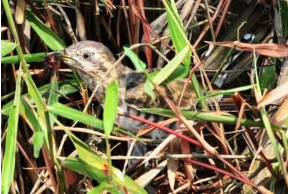
Figure 2 Adult Horsfield's Bronze Cuckoo Chrysococcyx basalis feeding on a caterpillar of the Tawny Coster Butterfly Acraea violae picked from the ground at Tuas Grassland on 14 June 2009 (Gloria Seow)

It appeared to prey exclusively on caterpillars and nothing else, catching about four to five of the larvae in 25 minutes of observation.