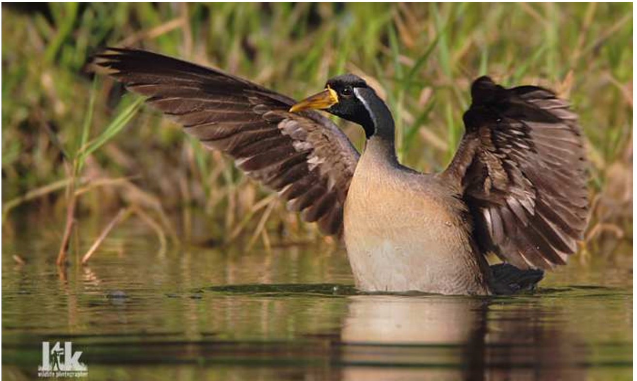
Masked Finfoot Heliopais personata at Upper Seletar Reservoir on 11 January 2010