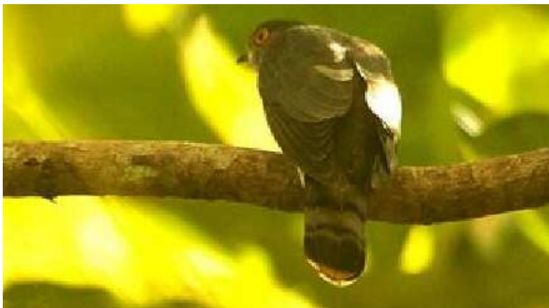
Hodgson's Hawk Cuckoo at BBNP on 24 January 2010 by Wing Chong