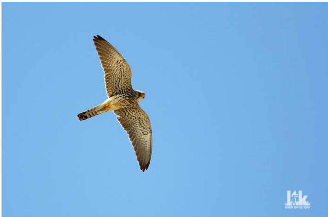
Common Kestrel, female, at Changi Cove on 290110, by Lee Tiah Kee