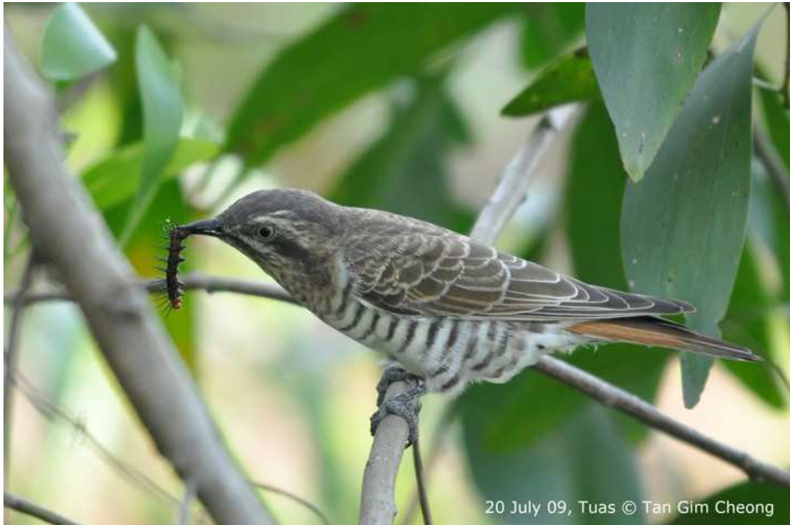
Figure 5: Adult Horsfield's Bronze Cuckoo Chrysococcyx basalis feeding on a caterpillar of the Tawny Coster Butterfly Acraea violae at Tuas Grassland on 20 July 2009

The 14 th prey item was an unidentified small centipede. The only other prey identified in Singapore is the caterpillar of another butterfly, the Lemon Emigrant Catopsilla pomona (Lim 2008).