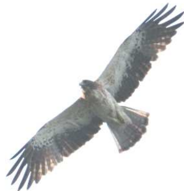
Booted Eagle, pale morph, at Seletar West, by Lau Jia Sheng