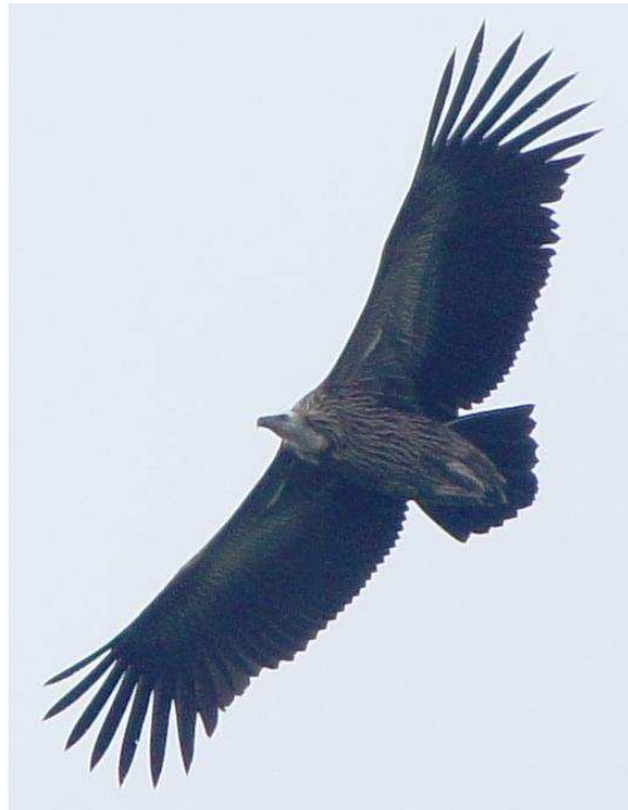
Himalayan Vulture, juvenile, in flight at MacRitchie on 150110