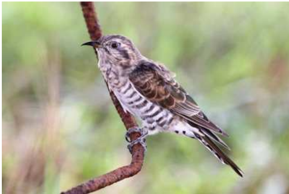
Figure 1: Adult Horsfield's Bronze Cuckoo Chrysococcyx basalis at Tuas Grassland on 14 June 2009 (Gloria Seow)

On 14 June 2009, Gloria Seow and Timothy Pwee observed an adult bird at Tuas Grassland (1° 20'N, 103° 39'É), in western Singapore (Figure 1). Following this sighting, Tan Gim Cheong observed the same bird on 16 and 20 July 2009, thereby recording the longest stay by this species from the previous record of seven days to the new record of 37 days. On all dates, observations were made of the foraging behavior of the lone bird, an adult. Studies of photographs taken in June and July indicate that the bird is probably the same individual.