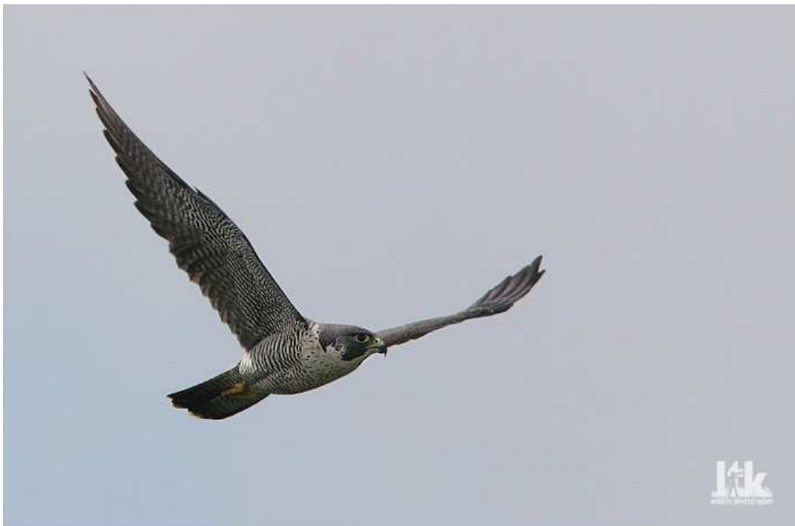
Peregrine Falcon at Kranji Reservoir on 270110