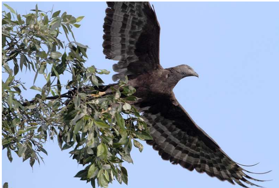
Oriental Honey Buzzard, dark morph, blind in right eye, at West Coast