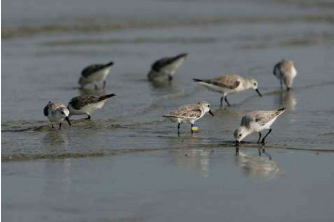
Flagged, Sanderling at Changi Cove on 17 January 2010

22 were counted at Changi Cove on 17/1 (JC/AC/WF/DaL/LKK/TSK). 1 member of this flock had a flag which showed that it was captured in Bohai Bay, China, in late July 2009; the distance between this site and Changi is 4,336 km with a bearing of 203 degrees (per DaL).