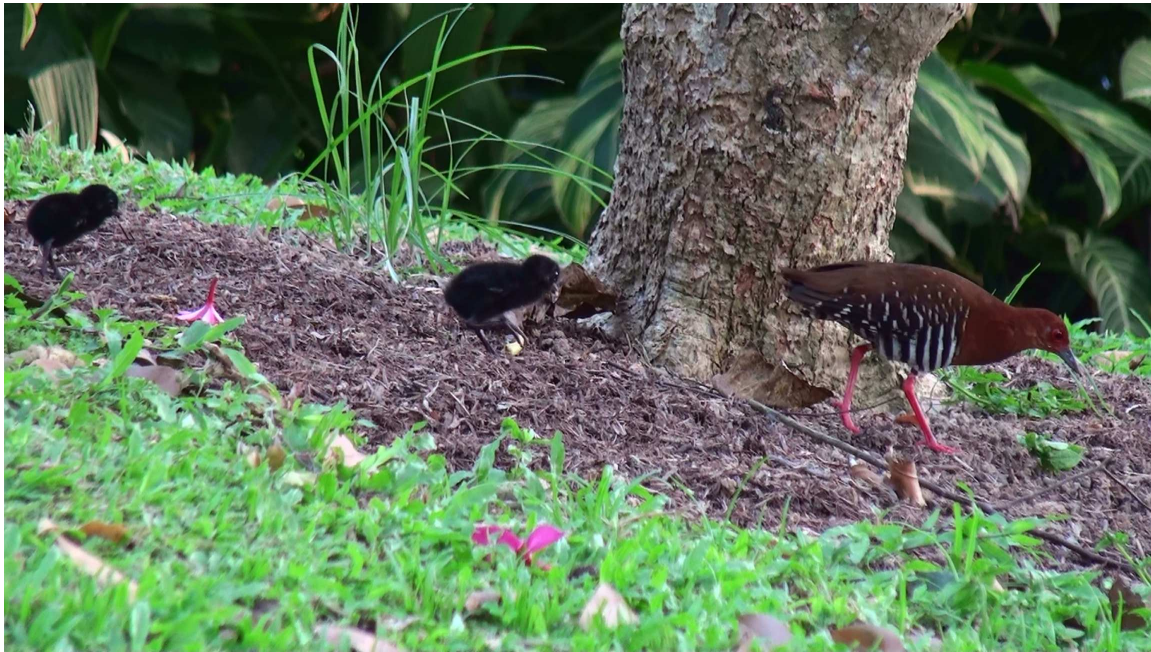
Red-legged Crake family at Singapore Botanic Gardens on 30 January 2010 By Felix Wong

A family of two adults and three chicks were seen foraging for food over 30 minutes at SBG on 30/1 (OEE/FW). FW writes, “Over that period, the adult caught earthworms on 2 occasions. The 1st time, it ran into the undergrowth and fed the earthworm to the chicks. The 2nd time, it fed itself with the earthworm. At around 7pm, 1 adult was seen uttering the typical territorial call, believe it's the male. The female will always utter some soft nasal contact notes to gather the chicks. The adults were tame but the chicks were more wary of human presence.”