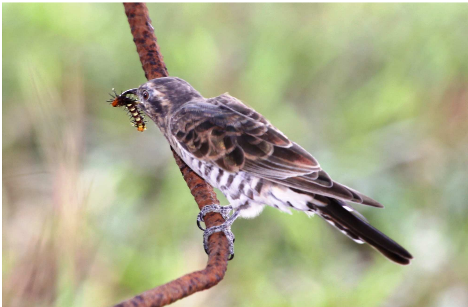
Figure 3 Adult Horsfield's Bronze Cuckoo Chrysococcyx basalis feeding on a caterpillar of the Tawny Coster Butterfly Acraea violae near the ground at Tuas Grassland on 14 June 2009