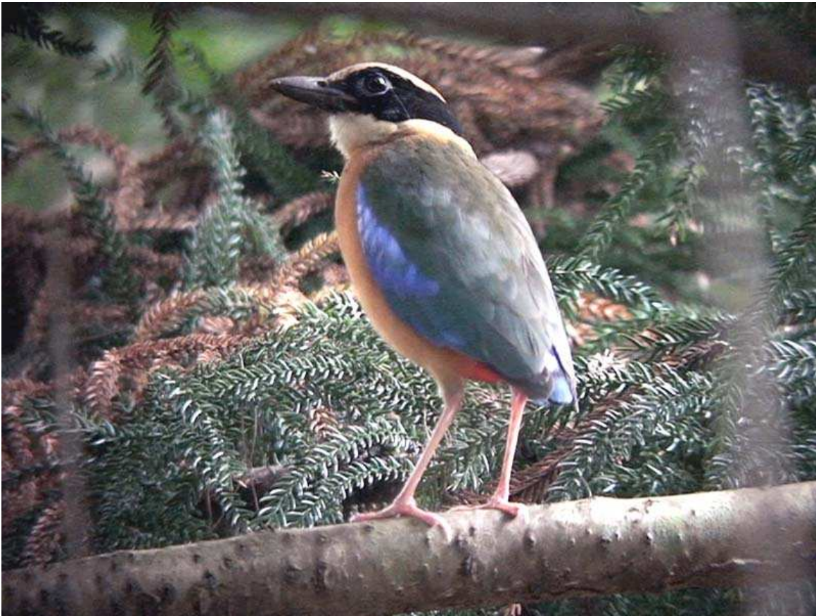
Blue-winged Pitta at SBG on 1 January 2010

1 photographed at SBG on 1/1 (AW/EW) and 1 heard at dawn at MacRitchie Reservoir on 29/1 (LKS/DS).