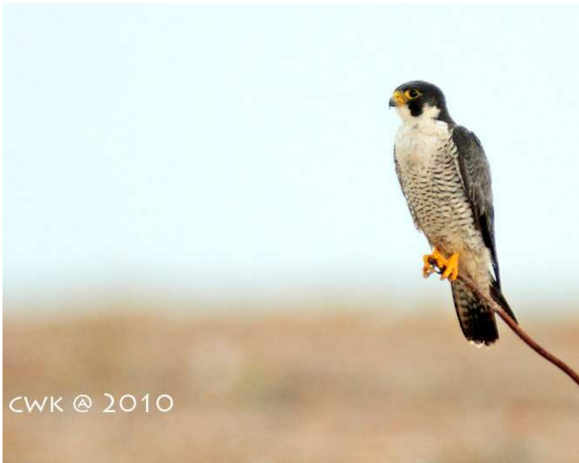
Peregrine Falcon at Changi Cove on 160310 (Photo by Jonathan Cheah).