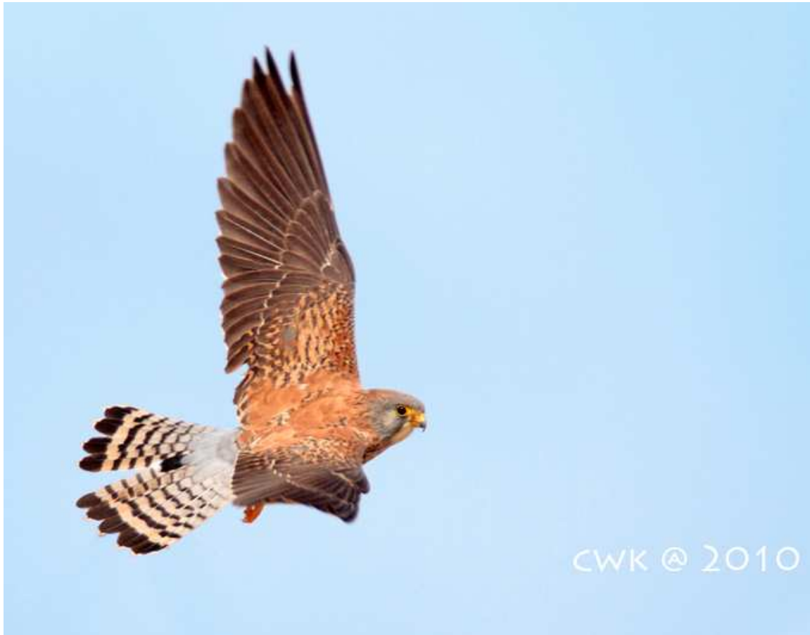
A (very) rare first winter male Lesser Kestrel at Changi Cove, March 2010. Note the back of the bird which is more plain and less spotted compared to the Common Kestrel.

Martti Sipponen spent many weekends at Tuas hoping for a repeat of the hundreds seen on spring migration last year but the birds did not show. Ulf Remahl kept up the vigilance concerning the Black Bazas at Singapore Quarry and he found out that the dead tree is a staging post in the morning. After roosting in the surrounding trees, the Black Baza spend up to an hour in the dead tree before taking off for the day.