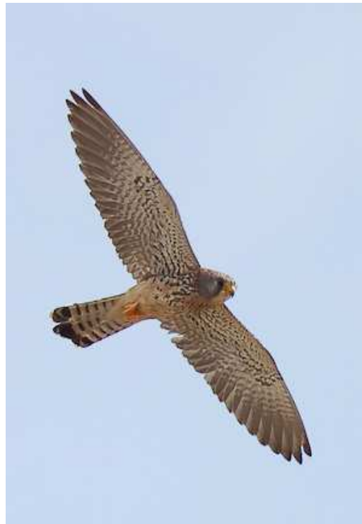
Lesser Kestrel at Tanah Merah/Changi Cove. Note the position of the wing tips relative to tail tip in the left photo, in the Common Kestrel, the wing tips does not reach as far.