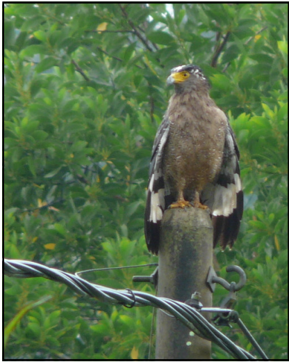
Crested Serpent Eagle greeting us at entrance

By the time we arrived at Lake Kenyir Resort & Spa, it was almost 1800hrs. The very first bird to greet us at the Main Entrance was a Crested Serpent Eagle trying to dry itself up after being drenched from an earlier downpour. As we drove towards the car park, we spotted Oriental Magpie Robin flittering in and out of the road pavement. The star bird of the evening got to be the Great Hornbill which flew in and greeted us at our chalet! It landed and perched less than 10m above our chalet. Everyone got excited including my 3-years old daughter, Victoria, exclaiming “Big Bird”. While we enjoyed good views of the hornbill for a couple of minutes, so did the mosquitoes who fed on us as if they have been starved for weeks. Thereafter we checked into our chalets. We were told by the staffs that the location of our chalet is one of the usual spots it can be found.