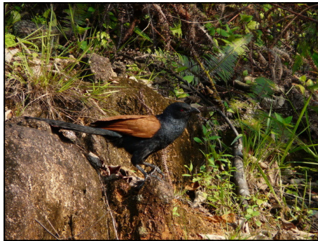
Greater Coucal along Waterfall Road