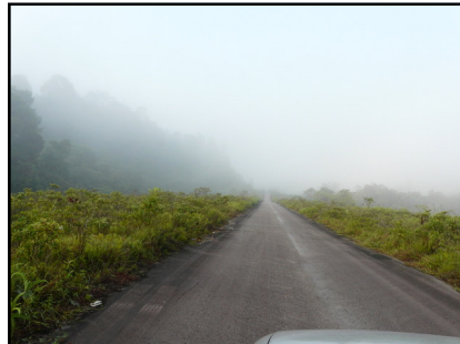
Early morning when the surrounding is blanketed by mist