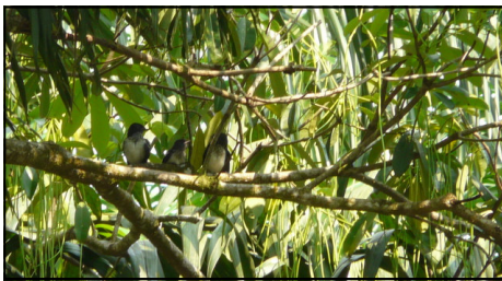
3 Oriental Magpie Robin Chicks