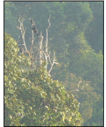
Bushy-crested Hornbills perched on bare branch.