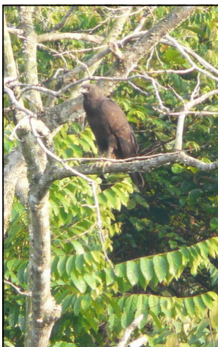
A dark-morph Changeable Hawk-Eagle