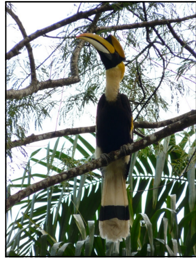
Great Hornbill perched near our chalets