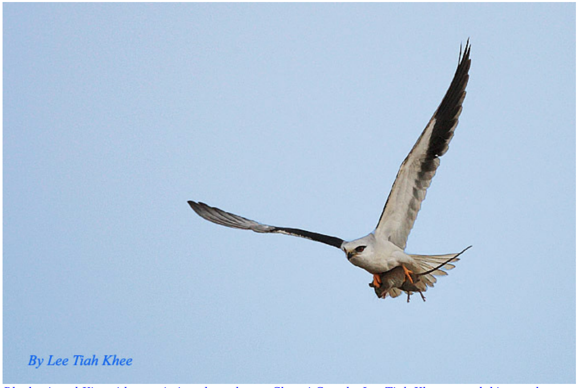
Black-winged Kite with a rat in its talon taken at Changi Cove by Lee Tiah Khee graced this month cover

The total count for migrating raptor for February was 104 boosted by a flock of 40+ Black Bazas at Sarimbun Camp on the 17<sup>th</sup>. We recorded a total of 9 species, 5 of which we suspected were wintering here. Again the Black Bazas topped the count with 67% of the total. We finally got the overdue Jerdon's Baza at Springleaf on the 14<sup>th</sup>, with another record from Upper Pierce on 22<sup>nd</sup> awaiting confirmation. A Common Kestrel was a first for Sungei Buloh with a sighting of a female juvenile on 28<sup>th</sup>. Our previous sightings of this Falco were mostly at Changi Cove. The Peregrine Falcon made its reappearance at our downtown CBD area again, with one or two wintering at Pulau Ubin. Five Oriental Honey-buzzards were observed over at Telok Blangah. The only Harrier was an Eastern Marsh reported at Tuas partly because we had no access to Changi Cove. The most exciting find for the month was the rediscovery of the Bat Hawk after 58 years! Also we had the first photographic record of a rare nocturnal raptor, the Barred Eagle Owl , taken in Pulau Ubin.