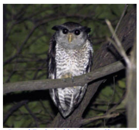
Barred Eagle Owl