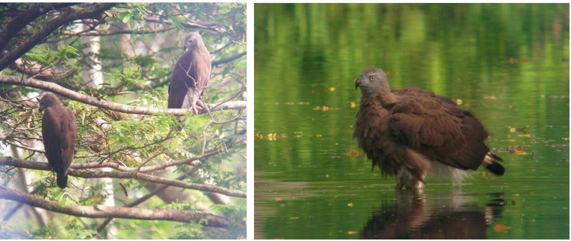
A pair of Grey-headed Fish Eagle with one flying down to a shallow stream at Springleaf by Danny Lau