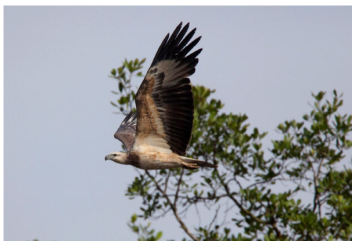
Juv White-bellied Sea Eagle by Martti Siponen