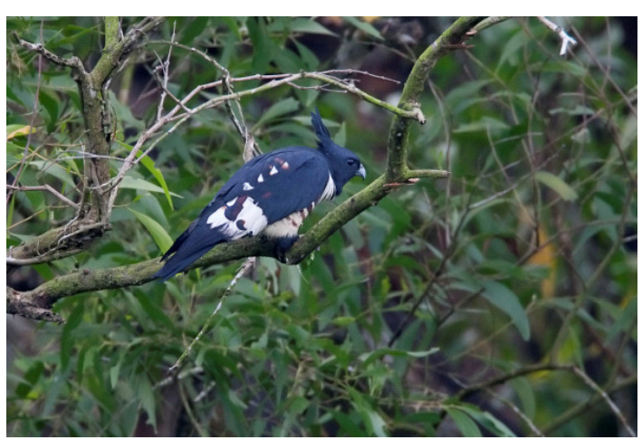
Black Baza at Japanese Gardens by Martti Siponen