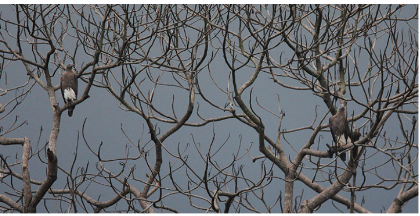
Grey-headed Fish Eagles at Lower Pierce by Lee Tiah Khee