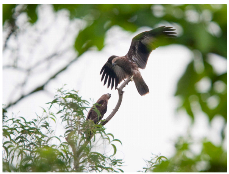
Juvenile Brahminy Kites at SBWR by Martti Sipoden