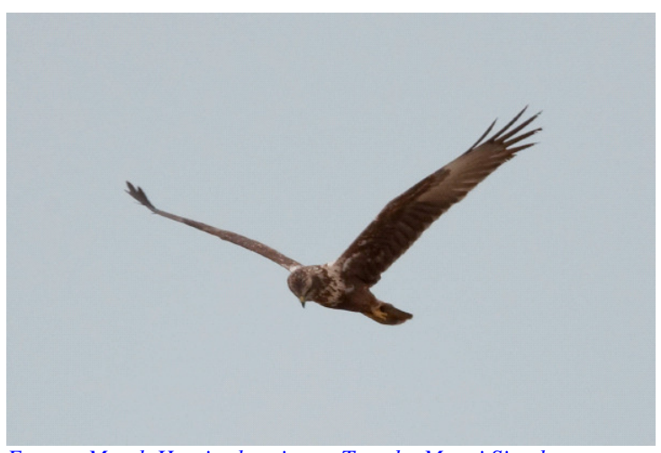
Eastern Marsh Harrier hunting at Tuas