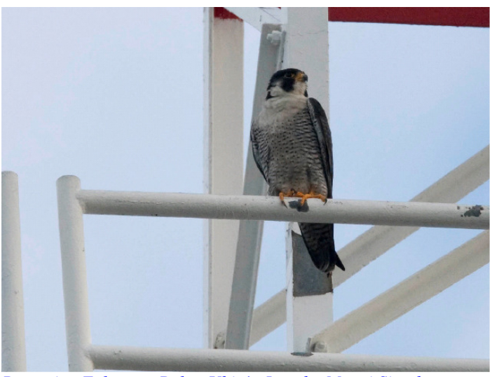
Peregrine Falcon at Pulau Ubin's Jetty