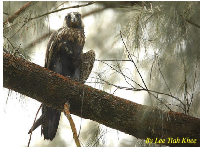
Peregrine Falcon (juvenile) by Lee Tiah Khee at Japanese garden.