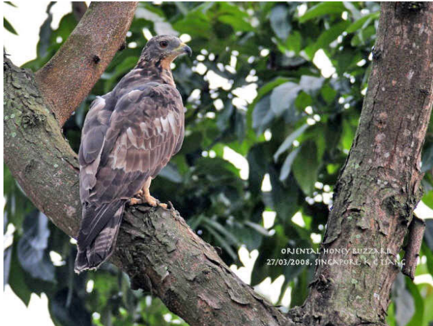
Crested Honey-buzzard by KC Tsang