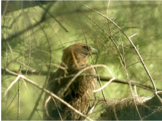
Booted Eagle, dark morph, at Seletar West