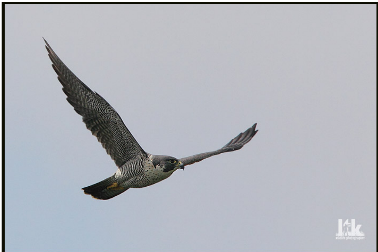
Peregrine Falcon at Kranji Reservoir on 270110