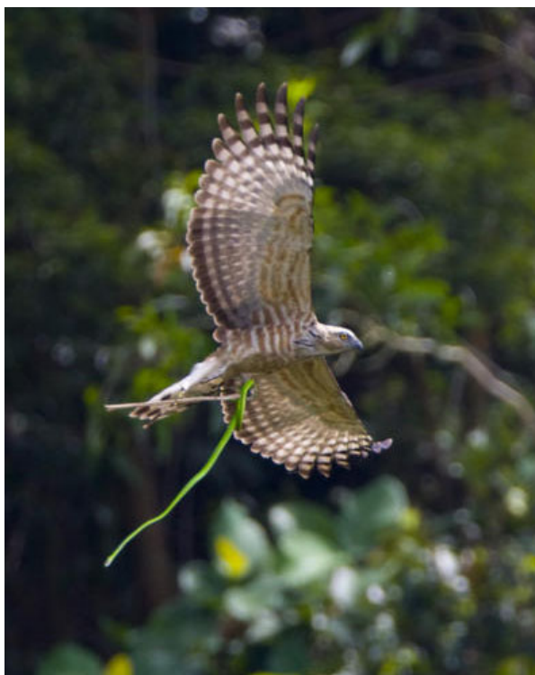
Jerdon's Baza with snake in talons at Singapore Quarry on 090110

Compared with previous years, January 2010 was a good month with 196 raptors from 14 migrant species reported. Amazingly, this number is almost thrice the total number (66) reported last month when 9 migrant species were reported. Black Bazas continued to be the most numerous at 130 birds, with a flock of 50 reported by Mike Tan at Upper Jurong. Oriental Honey Buzzards came in second in terms of numbers with a total of 27. Three migrant species were recorded for the first time this season. January 2010 also marked the month when a good haul of 3 rare sedentary (resident/non-breeding visitor) raptors were reported.