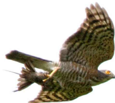
Crested Goshawk with prey in talons at Singapore Quarry on 230110, by Martti Siponen