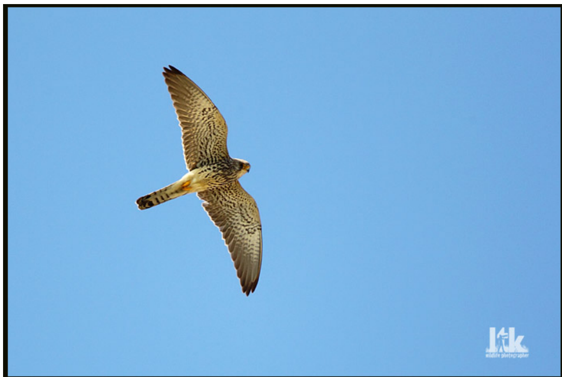
Common Kestrel, female, at Changi Cove on 290110