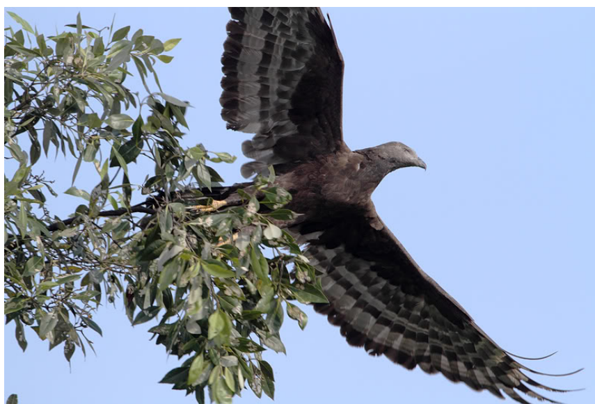
Oriental Honey Buzzard, dark morph, blind in right eye, at West Coast