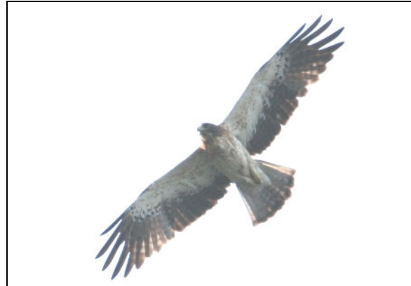
Booted Eagle, pale morph, at Seletar West, by Lau Jia Sheng