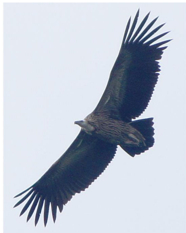
Himalayan Vulture, juvenile, in flight at MacRitchie on 150110