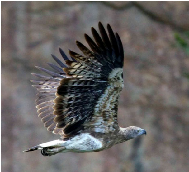
Grey-headed Fish Eagle, 2 nd -3 rd year bird at Singapore Quarry, by Martti Siponen