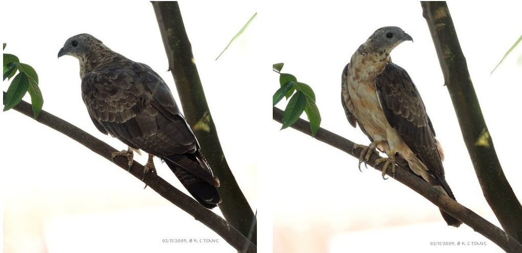
OHB from his bedroom's window!