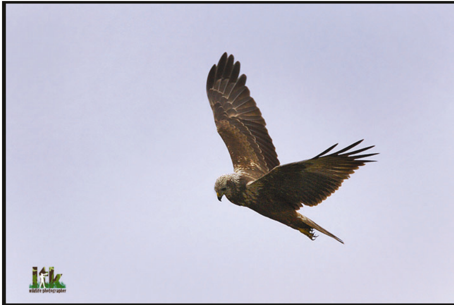
Eastern Marsh Harrier gliding over Changi Cove