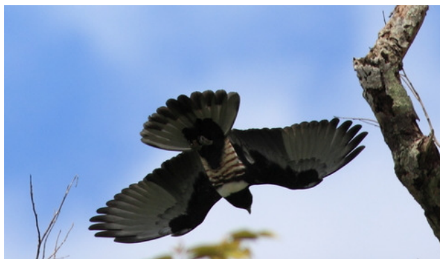
Black Baza at NTU Nanyang Crescent by Howard Banwell